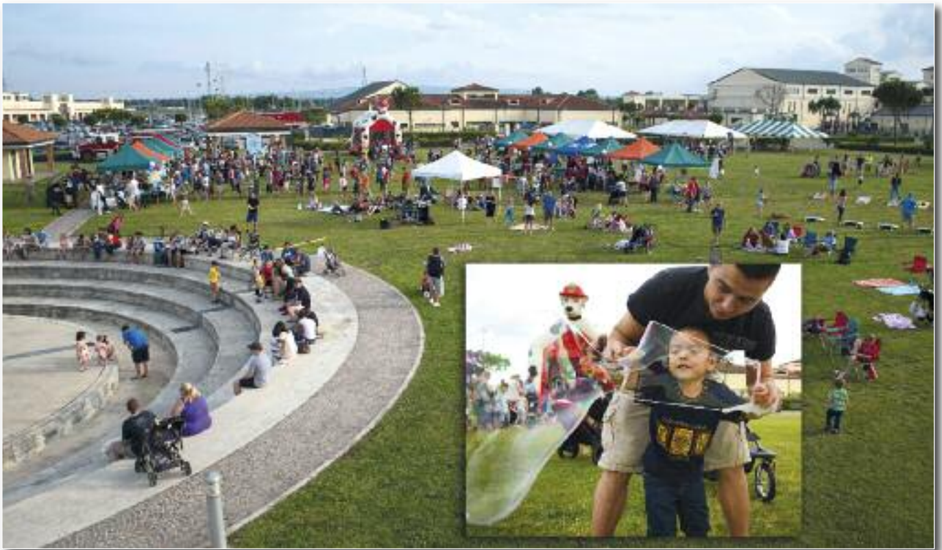
Hundreds of families in "Central Park" – a large open space on board Support Site – during Summerfest, one of many annual events hosted throughout the year that is enjoyed by community members. The outdoor base amphitheater is the site of numerous performances during the year.

1840/1840R) and submitted it to the shipper within 70 days of delivery of the household good to the new residence. This is a vital requirement. If the form was filed correctly, the U.S. government will be able to hold the shipper accountable for damages and losses. If the form was not filed correctly, the claims officer is required to reduce any award to the claimant by the amount the government would have recovered from the shipper. Failure to file this form with the PPO can reduce your potential claim to nearly zero. This is a vital requirement.