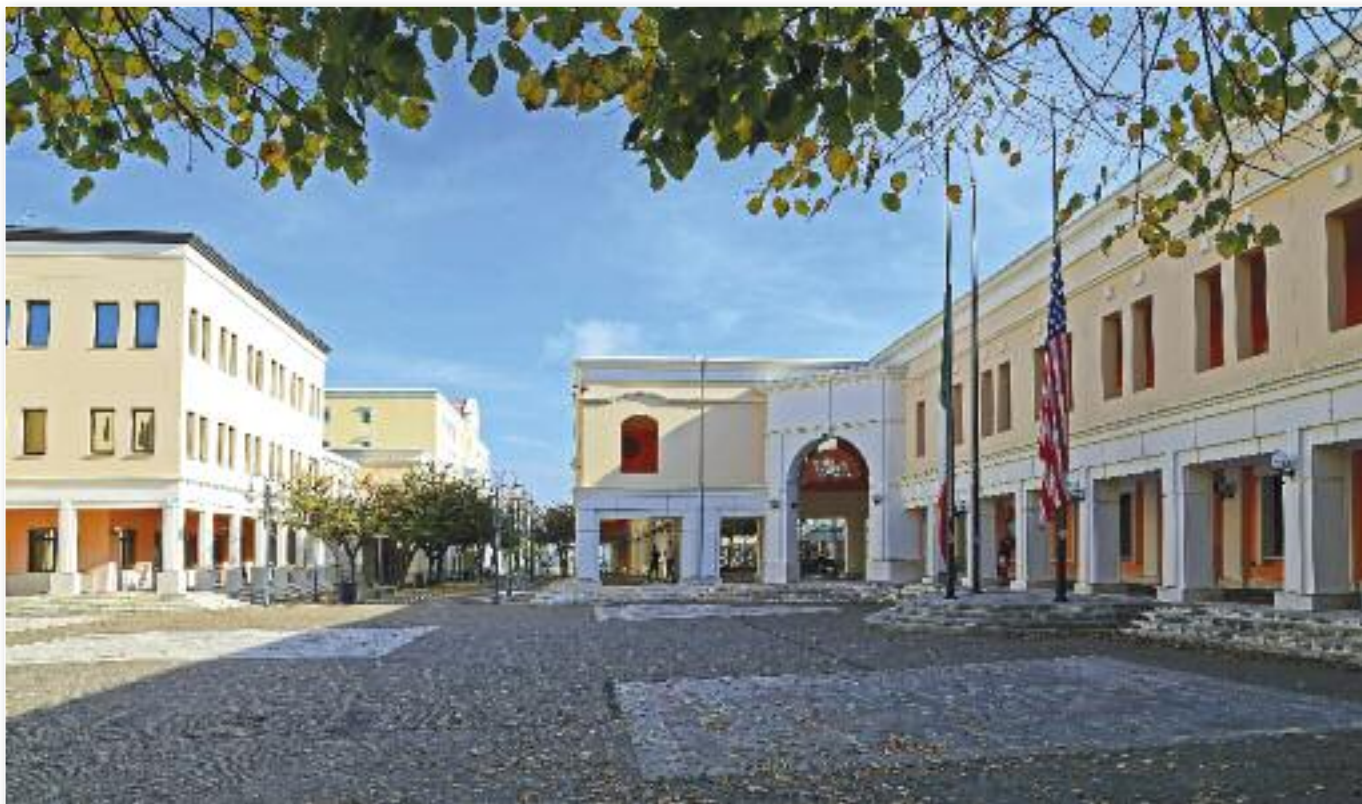
U.S. Naval Support Activity Naples is host to more than 50 separate commands and approximately 8,500 personnel. The main square and "spine" aboard the U.S. Naval base at Capodichino.

Before you travel to Italy you must have all necessary documents for the permit – specifically, a Missione visa