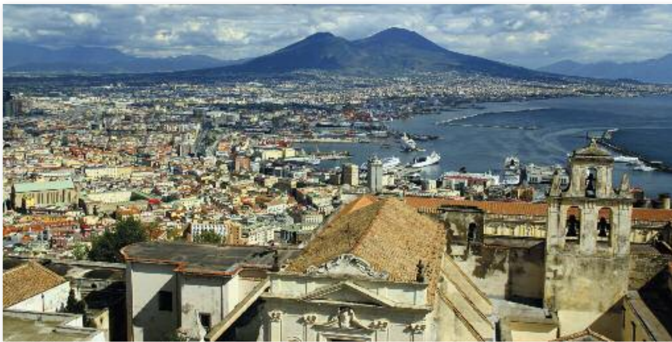
Naples is the capital of Southern Italy's Campania region, and is host to the U.S. Navy and NATO. It is steeped in ancient history and is one of the most culturally interesting and vibrant cities in Europe. To the right is the Bay of Naples, and in the distance is Mount Vesuvius, one of the most active volcanoes in the world.

The USMRA-SI serves as a link between local area retirees, various military agencies and the U.S. Consulate in Naples. Information is available online at http://usmra-si.tripod.com or by calling 329-208-7315.