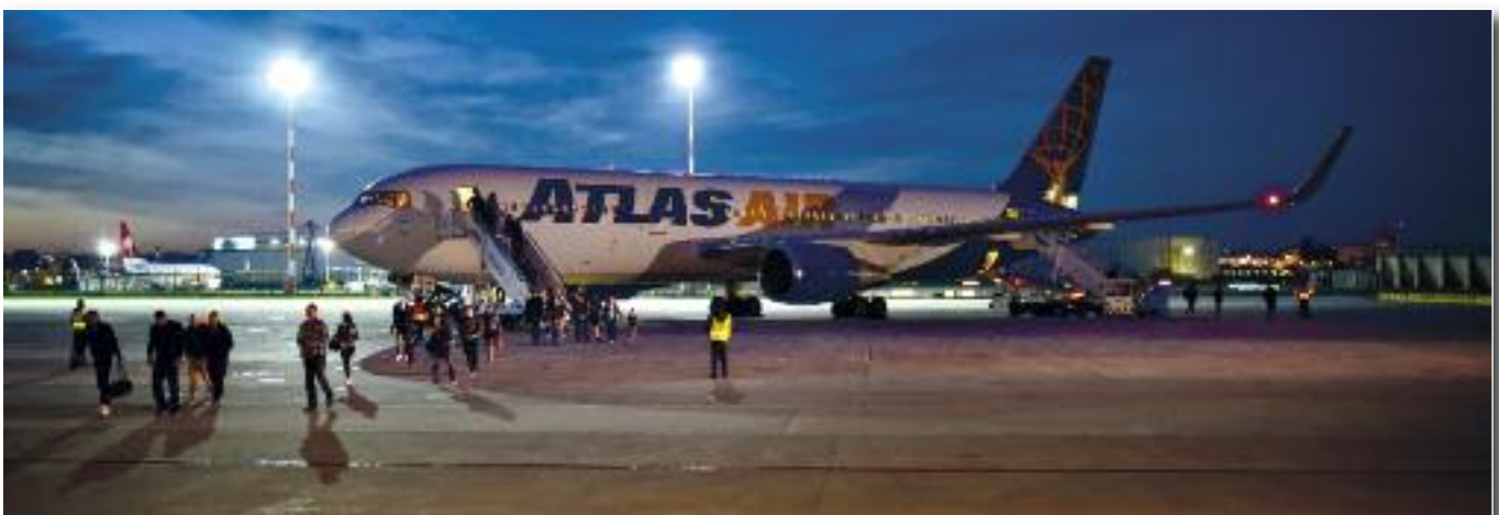
Most new arrivals who report to Naples will land at the Capodichino Air Terminal.