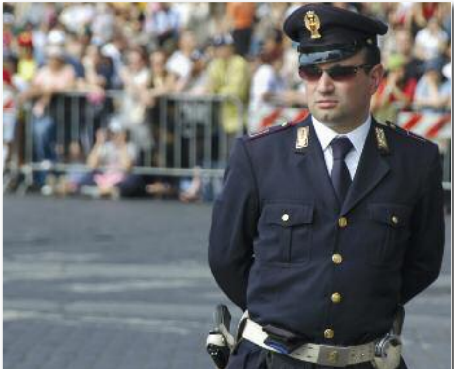
Polizia perform all the usual duties as the U.S. police and usually wear green-gray or blue uniforms. Under the Status of Forces Agreement (SOFA) between the United States and the Republic of Italy, all U.S. military personnel, members of the civilian component and their family members are subject to Italian law and come under Italian jurisdiction for most criminal offenses.

Carabinieri (Gendarmerie) – This is a special corps of the Italian military which acts both as military and civilian police. They usually wear blue or black uniforms and are recognizable by the white shoulderbelt across their chest.