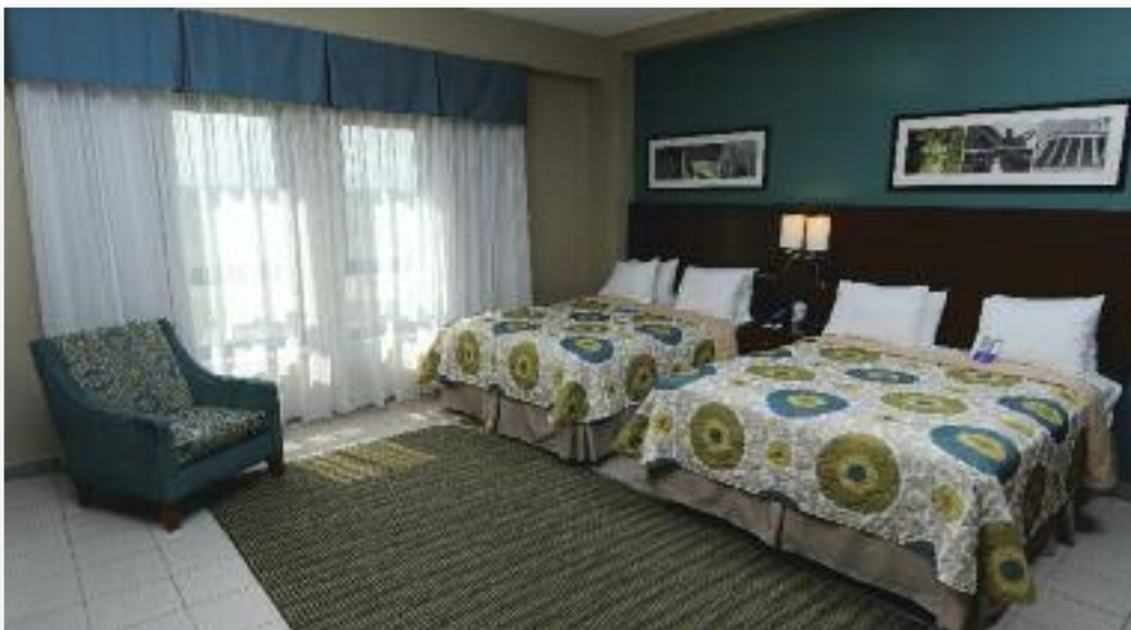
With its spacious, comfortable rooms, your stay – no matter how long or short – at the Navy Lodge on board Support Site is sure to be an enjoyable experience.

tiate a contract hold, or release your hold and let someone else take the property. All regular holds are automatically released after two working days unless you request an extension. During these two days, you may continue to look at other houses. Only one regular hold extension is permitted per property.