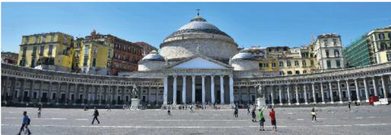
Piazza del Plebiscito is the largest public square in Naples. It is flanked to the east by the Royal Palace of Naples and on the west by the church of San Francesco di Paola, and is located near the world-famous San Carlo Theater and the Galleria Umberto I.