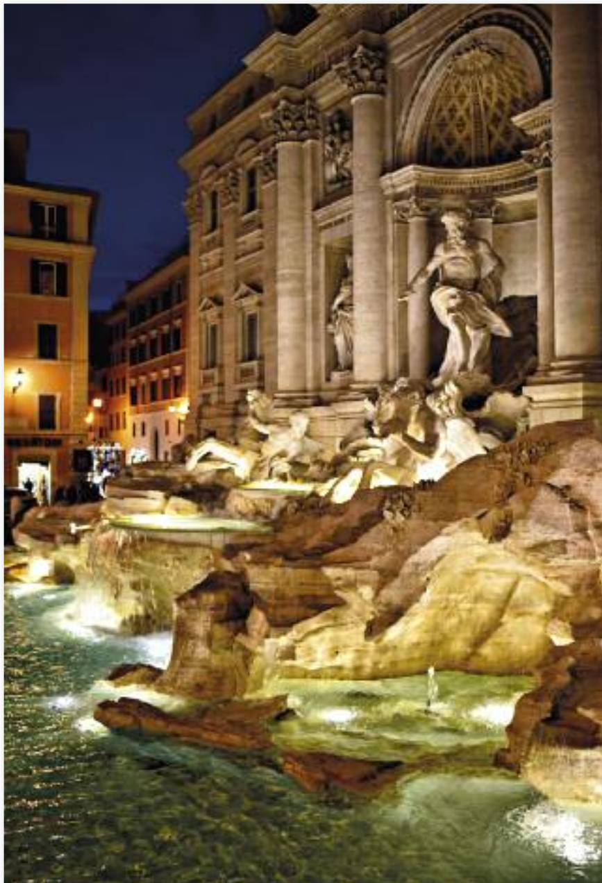
The historic Trevi Fountain – located in the heart of Rome – is a popular tourist destination. Constructed in 19 BC to supply water for the ancient Roman Baths, it was featured in the 1960 film “La Dolce Vita” by Federico Fellini, which starred Anita Ekberg and Marcello Mastroianni.

Any move is filled with stress and distractions, and your move here will be no different. Culture shock, jet lag and many other irritants will likely be a part of your PCS experience. Your command and your sponsor will help you adjust and get settled. Coming prepared will minimize your worries. Follow guidelines in this book, and you can smooth out many of the potential wrinkles in your upcoming move.