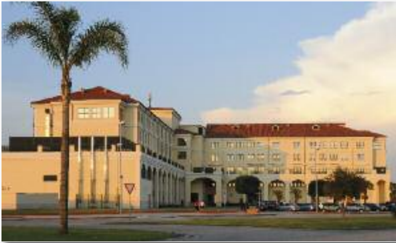
The Navy Lodge Naples, located on board Support Site, offers 96 guest rooms and 24 villas.