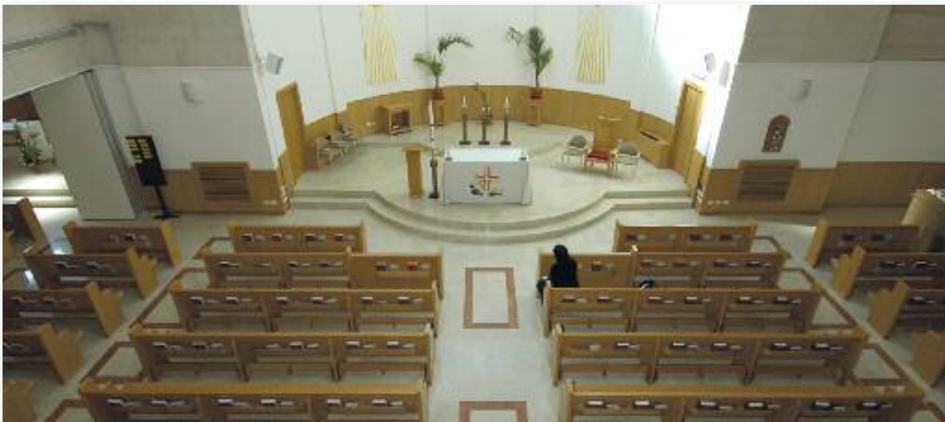
The Support Site Chapel is used for religious services, meetings, retirements and many other events.

Sponsorship Training should be attended in order to prepare other incoming personnel with their transition to Naples. The Loaner Locker program, another FFSC resource, loans kitchenware and small appliances to those still awaiting their household goods or those that have shipped them out due to PCS'ing. Additionally, the FFSC hosts Smooth Move, a class to help departing community members check out easily and efficiently.