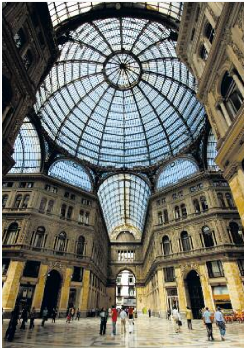
Opposite the world-famous San Carlo Theater is the Galleria Umberto I, the most elegant shopping mall in Europe.

A pocket dictionary or phrase book is a valuable tool