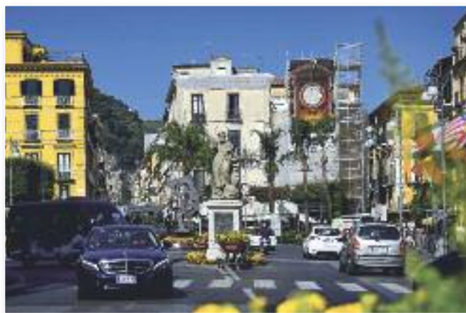
Driving in Italy is more challenging than in the United States because traffic here is less regulated and road conditions are more hazardous.

Note: Importation of all-terrain vehicles (ATVs), three-wheelers and off-road motorcycles is highly discouraged.