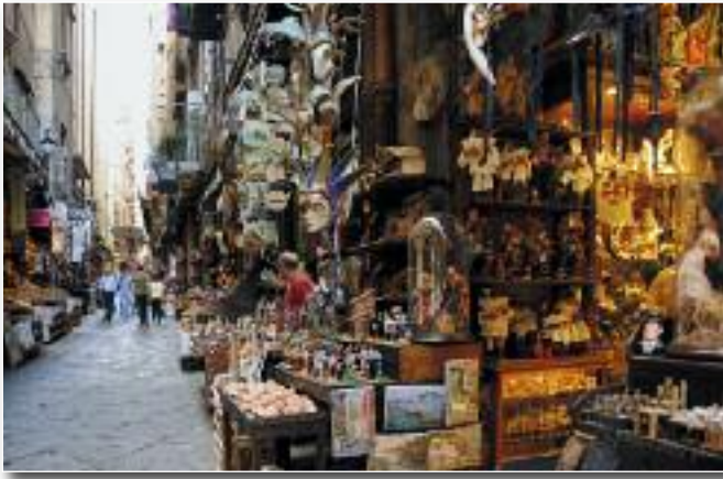
Nearly every town and city offers open air markets, which are a great way to find bargains and get a taste of Italian culture.

Often, it takes Americans some time to get used to bartering. Americans are used to going to stores and paying whatever price is marked on the item. While that is true of Italian stores, in the markets – the rows of stalls set out in alleys or back streets – you can buy almost anything for any price you and the seller can agree upon. Food items and fruit and vegetable prices are not haggled over very much.