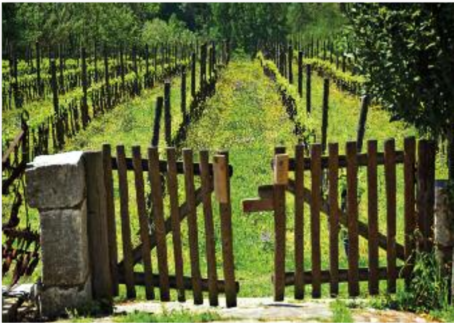
During a tour of Italy one will come across many vineyards and wineries. Almost every region of Italy produces its own varieties of wine, with 20 major growing areas. Tours of local wineries are offered often through USO, MWR and other agencies.