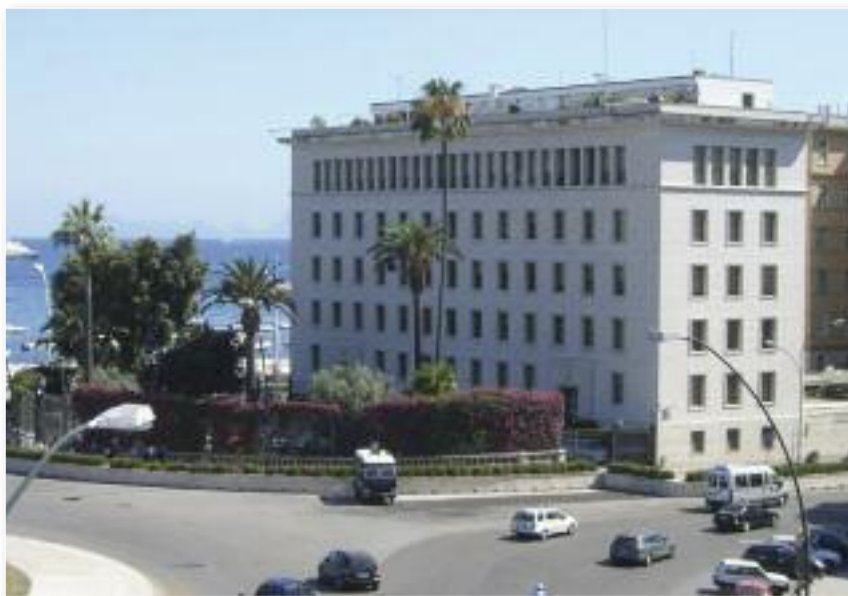
The U.S. Consulate General of Naples is located along the waterfront at Piazza della Repubblica.

The NATO Status of Force Agreement (SOFA) recognizes the jurisdiction of the United States over its military personnel in the performance of their assigned duties.