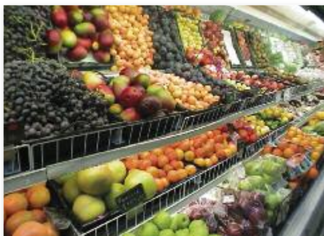
The Commissary is located at the Support Site in Gricignano, and features a deli, a bakery and a bistro for quick service, as well as special order services.