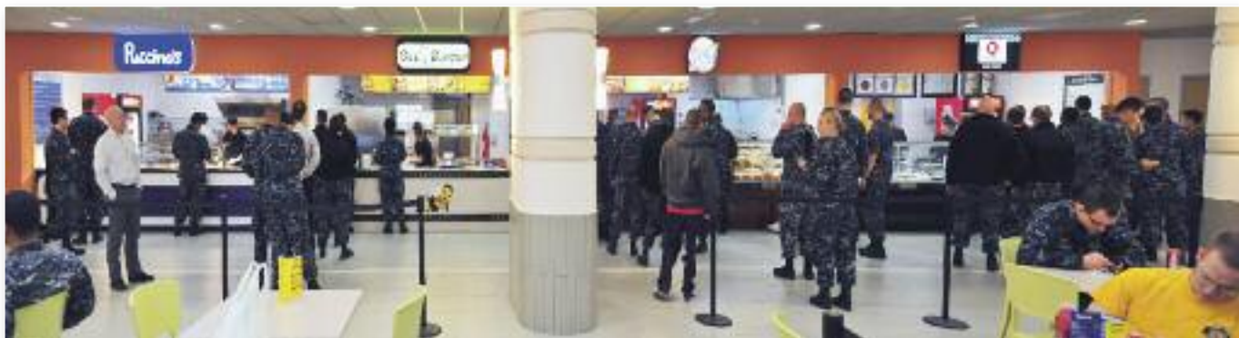
The Bella Napoli Food Court is located at Capodichino and houses several restaurants, a café and a pub.

Strikers at the Support Site bowling center serves up all your favorite foods including pizza, fresh cooked hamburgers, and opens every morning for the best American breakfast in Naples. In the same building you'll find the O'Rhys Irish Pub, where you can enjoy a traditional pub atmosphere while you are waiting for a lane, a movie, or