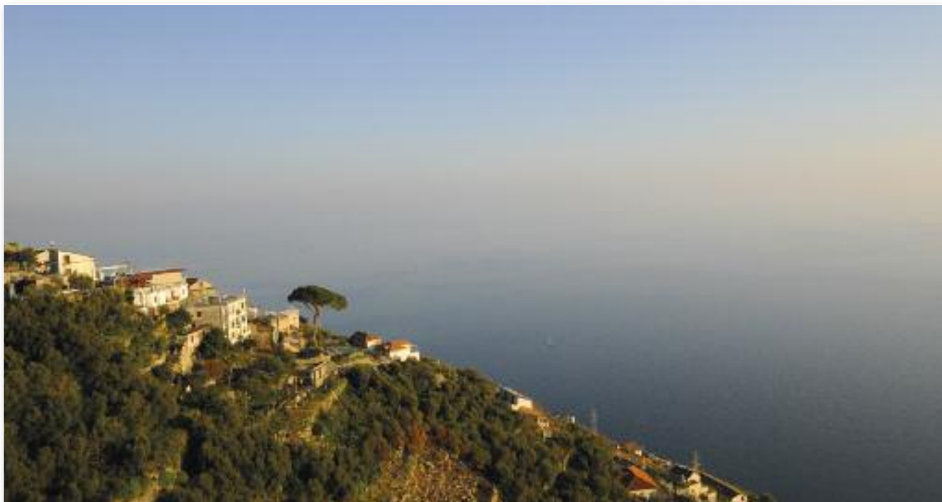
Travel and leisure opportunities through Tickets and Travel, and USO are almost limitless. One of the most accessible and popular day tours is to the Amalfi Coast, which offers spectacular, breathtaking views.

MWR has two libraries: one at Capodichino and one at Support Site. The newly-renovated Capodichino facility Connections: Media, Library, Travel & Info, includes a lounge, computer and study room, meeting room, free Wi-Fi and the ITT office. The book selection includes popular fiction, non-fiction related to military, travel, language and local area info and books for college students, audio-visual materials, and video game collection. Both libraries offer books, CDs and DVDs for check out, audio-books (on CD and Playaways), an interlibrary loan program, and reserve book services. Additional offerings include periodicals, on-site computers with Internet access and the digital library https://mwrdigitallibrary.navy.mil/ for ebooks, audiobooks, foreign language learning, test prep and much more. Story time is offered weekly for preschool children at the Support Site library, and a summer reading program is held from June through August. Each month the libraries present extensive information on various eth-