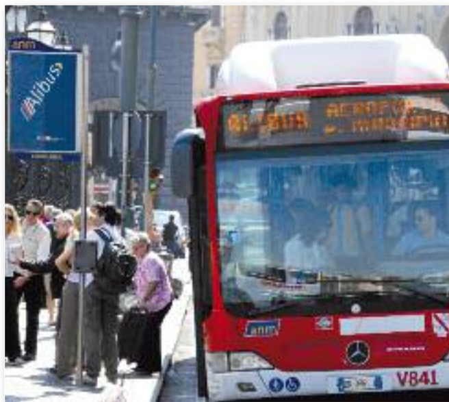
From the airport, take the Alibus directly to the central station at Piazza Garibaldi and beyond to the main port, Molo Beverello. Purchase tickets on the bus.

For €4 one-way, the Alibus circulates between Capodichino Airport, Piazza Garibaldi Central Train Station and Molo Beverello, the main port in Naples (close to the Castel Nuovo, Piazza del Plebiscito and Piazza Municipio). The Alibus runs every 20 minutes. Another alternative to reach Capodichino from the city center is route C68, which connects Piazza Carlo III in the city center with Via Fulco Ruffo di Calabria, the street with the roundabout directly outside Naval Support Activity Naples Capodichino.