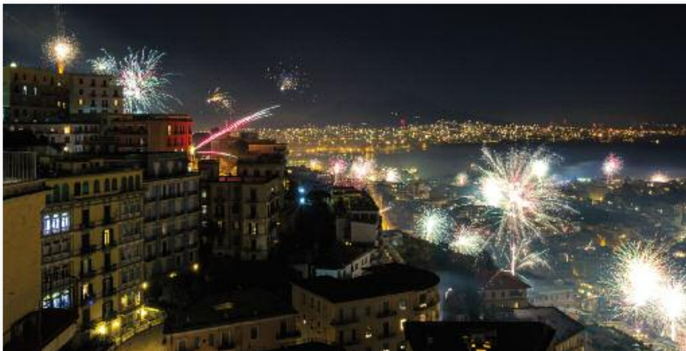
Naples celebrates each New Year's Eve with a blanket of thousands of fireworks, which collectively are bright enough to light up the Bay of Naples and nearby Mount Vesuvius.

Overseas Housing Allowance: The Overseas Housing Allowance (OHA) is paid to service members who live in privately leased housing at their overseas duty station. Residents of government quarters do not receive OHA.