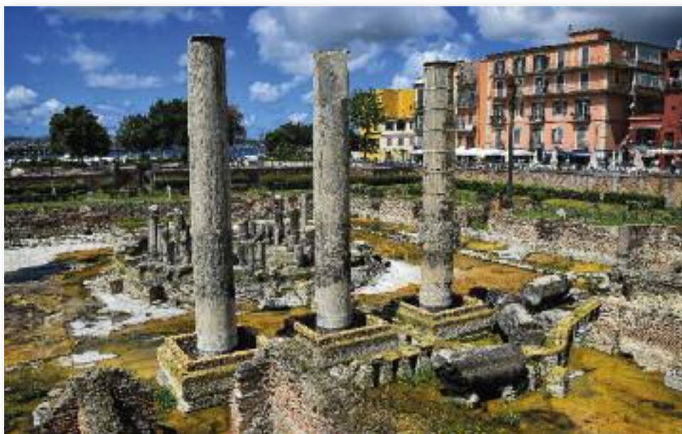
The ruins of Macellum (market building ) was built in the Roman colony of Puteoli (now known as Pozzuoli) nearly 2,000 years ago, and excavated in the 18th century. The base of the columns appear to be surrounded by water, but this is an example of how the ground has moved slowly up and down with the ebb and flow of magma chambers deep within the earth.

Aversa is a town in the province of Caserta, less than 10 minutes away from the Support Site. It is an important rail junction, as well an area where the famous Asprino wine and mozzarella di bufala cheese are produced. It has many interesting monuments and churches, as well as numerous