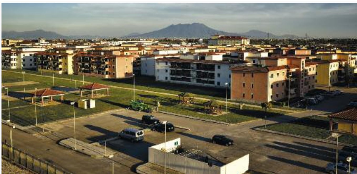
Housing on board Support Site near Gricignano.

To book your reservation, call DSN 629-6289 or Commercial 081-813-3443.