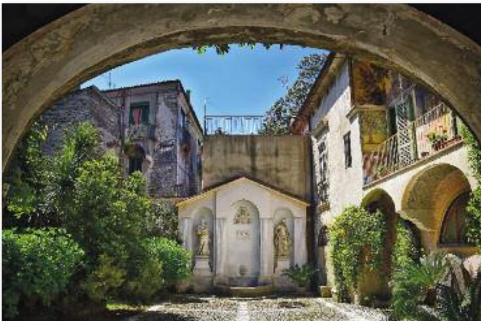
Arches are an integral part of architecture in Italy, both historical and present day. Throughout the country you can find elements of this design whether in famous Pompeii, bustling Rome or in ruins underground.

based on U.S. Navy and Italian environmental sampling data. In these zones, U.S. Navy personnel are not permitted to sign new rental home leases.