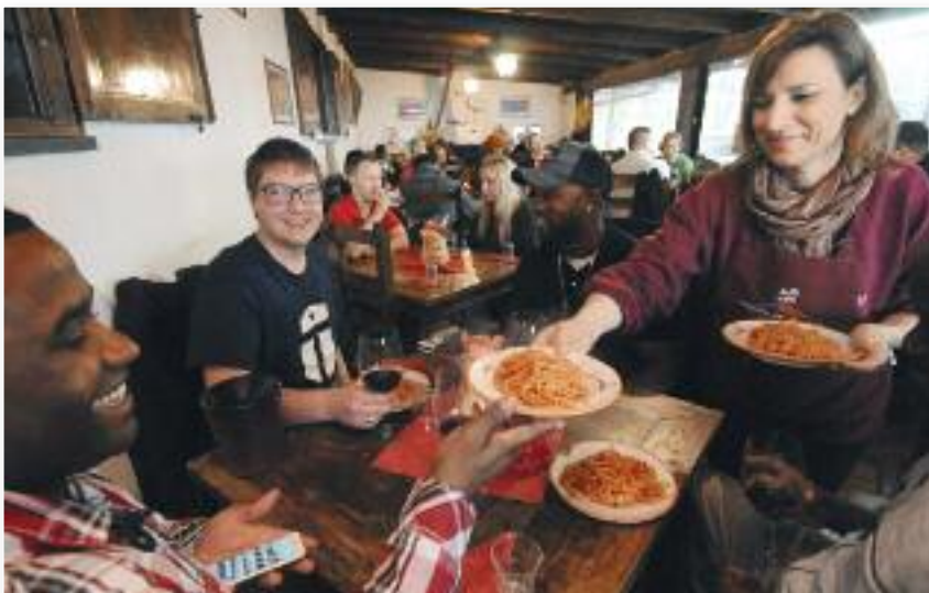
You will probably discover that dining out is one of the best ways to experience Italian culture first hand after arriving in Italy.

behind the statue of Garibaldi. This is a commercial district, and most tables of items for sale are located just outside small shops.