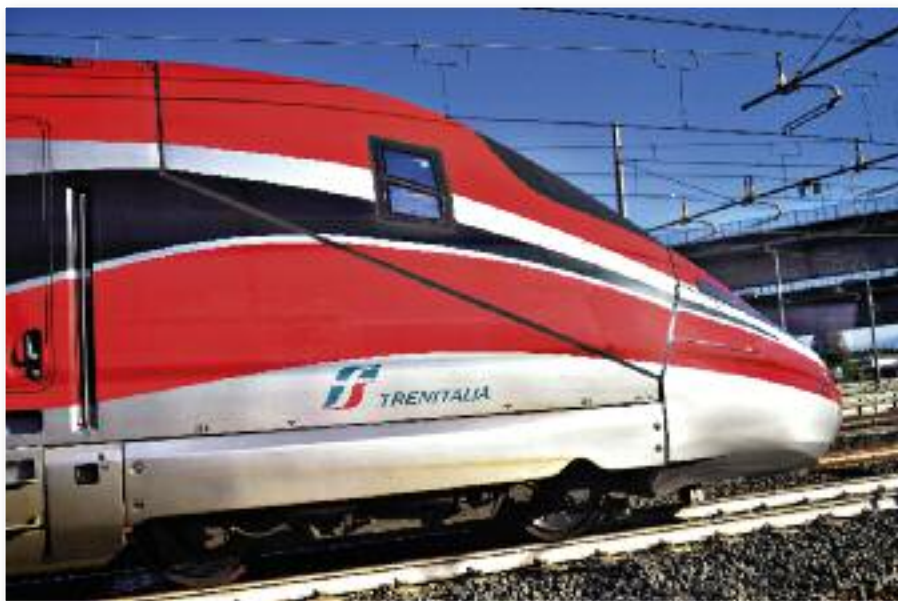
The train system is a fast and economical way to make your way around Naples and also Italy and the rest of Europe.

• Montesanto: This car runs from Montesanto to Via Morghen in Vomero, a few blocks from Piazza Vanvitelli.