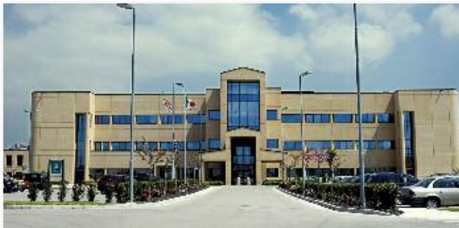
U.S. Naval Hospital Naples, located at the Support Site, provides medical care for active duty and retired military personnel, and also command-sponsored civilian personnel and their families.

The dental clinics provide a wide range of dental services. These services include general dentistry, preventive