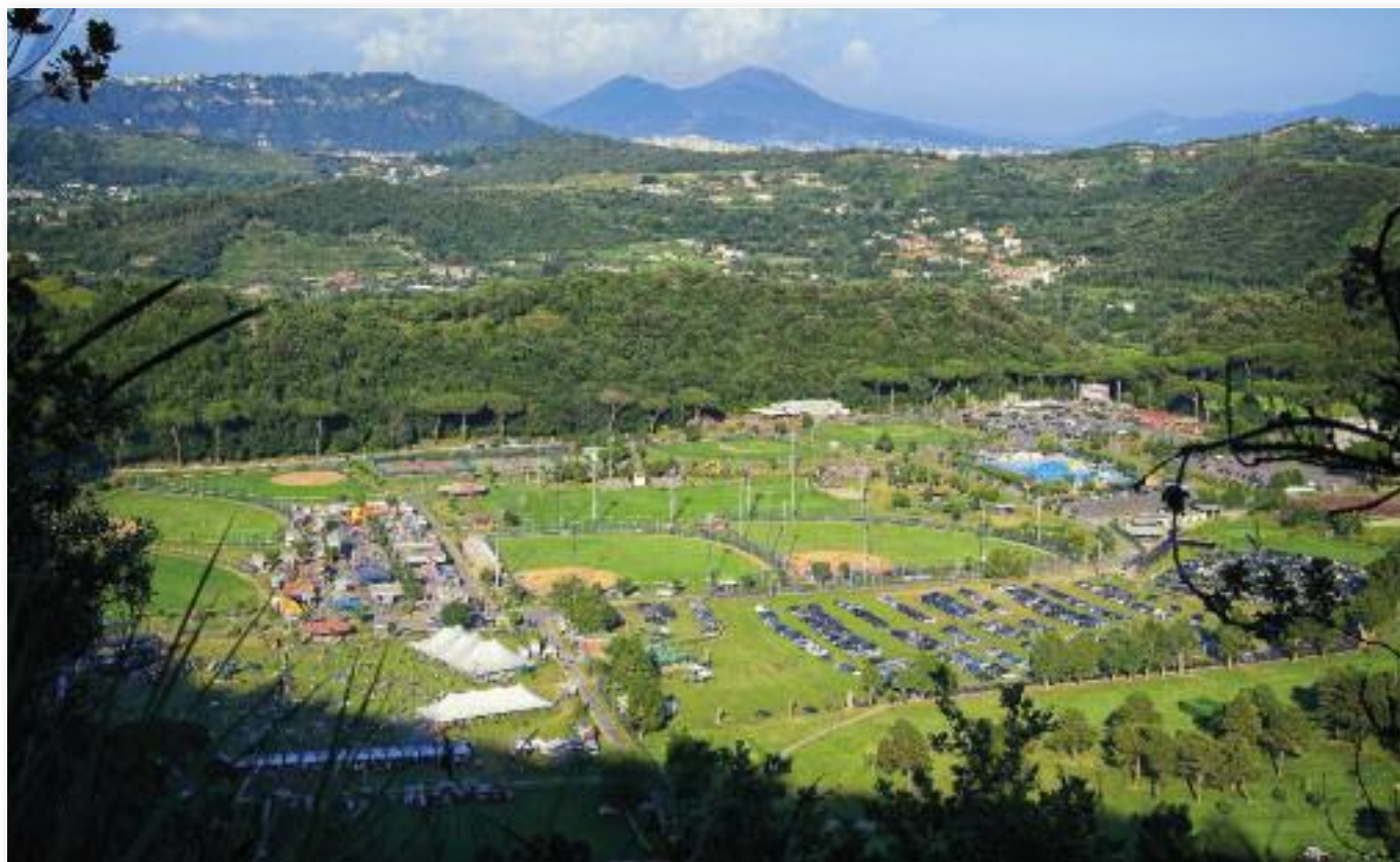
A birds-eye view of Carney Park, a 93-acre park located inside an extinct volcano, Monte Gauro, about 14 miles west of Naples. It offers a wide variety of recreational activities for adults and children.

The Carney Park Golf Course has nine holes with a 69.0