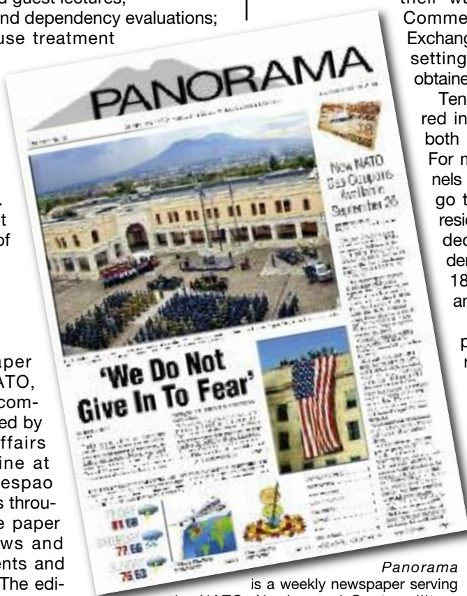
Panorama is a weekly newspaper serving the NATO, Naples and Gaeta military community in Italy.

Every work day, AFN Naples produces 12 hours of live, local radio shows, including news, information, and the best music of the '80s, '90s and today on 107.0 FM "The Eagle." This station is also carried on the command channel in government housing. Additionally, AFN Naples offers 106.0 FM Powernet, featuring the most popular syndicated talk and entertainment shows from the United States. These stations can be heard on decoder channels 182 and 183 in Europe and on standard radio