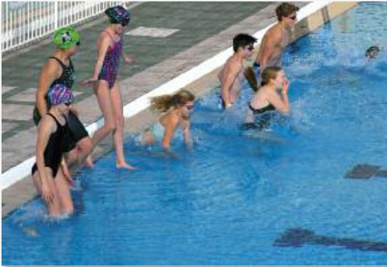
MWR offers a variety of aquatics programs at three pools located at Capodichino (year-round, indoor pool), Support Site and Carney Park, which are both outdoor pools.

nic and cultural events, complete with contests and drawings to make things interesting and fun. The MWR libraries' online catalog can be accessed at https://u10304uk.eos-intl.net/U10304UK/OPAC .