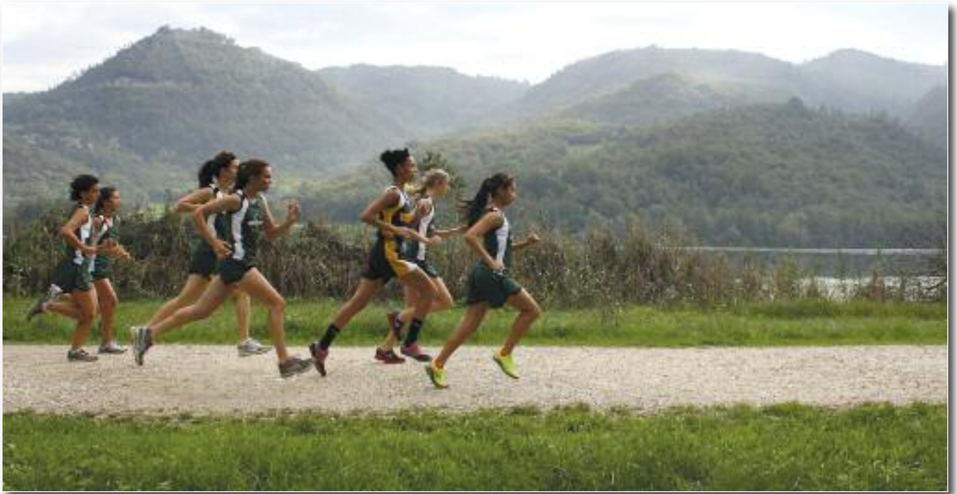
Athletics is an important and popular extracurricular activity for the Naples Wildcats.

and in developmental practices. The CDC environment is appropriate for each child's age level, and the program of services provides high quality child care. The Naples CDCs reflect the Navy's commitment to providing only the highest quality care for your child.