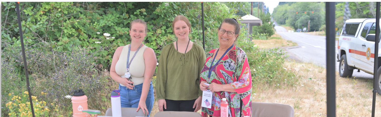
Bravo Zulu to everyone who participated in TRFB's annual Safety and Health Walk, 2024.