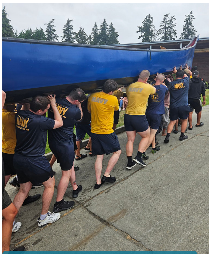
Sailors from TRFB assisted with carrying canoes from the water onto shore during the Suquamish Tribe's hosted portion of the 2024 Canoe Journey.