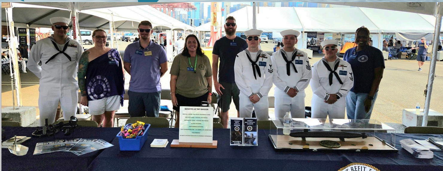
Bravo Zulu to everyone who volunteered to represent TRFB at Seattle Fleet Week, 2024.