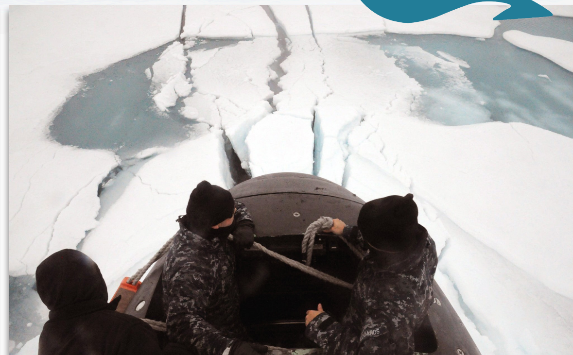
Crew members of USS Seawolf (SSN 21) inspect the boat after surfacing through Arctic ice, July 2015.