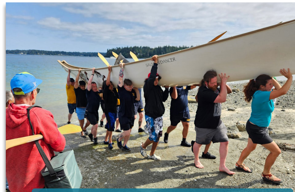
Sailors from TRFB assisted with carrying canoes from the water onto shore during the Suquamish Tribe's hosted portion of the 2024 Canoe Journey.