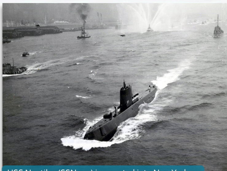
USS Nautilus (SSN 571) is escorted into New York Harbor on August 25, 1958.