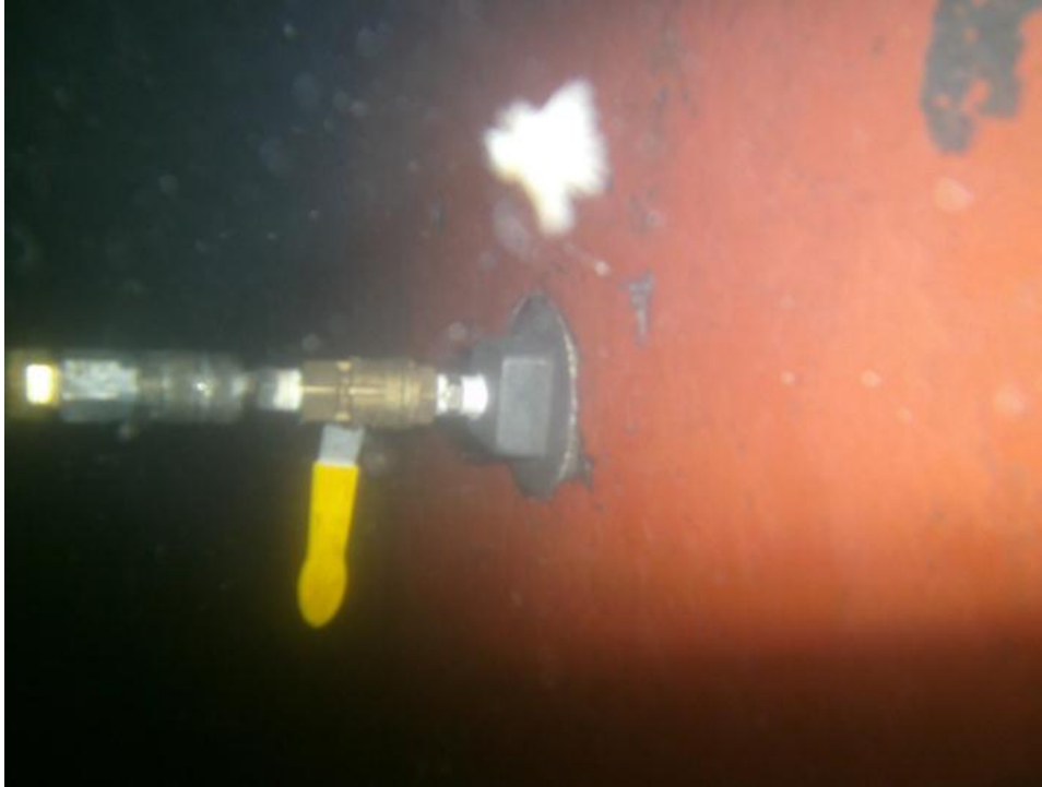
After the tapping was completed, piping was connected to remove salt water from the void via pressurization with nitrogen IAW UWSH standard procedures for dewatering rudders post repair.