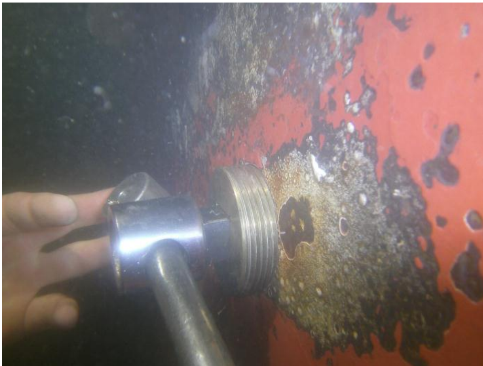
A new 2-1/2" brass plug IAW ASTM B21 was installed and staked in place.

During the pressure test on 15 August 2013, it was noticed that the top access plug was leaking too. DFS was submitted and approved and SWRMC divers resumed by drilling and tapping. The job was