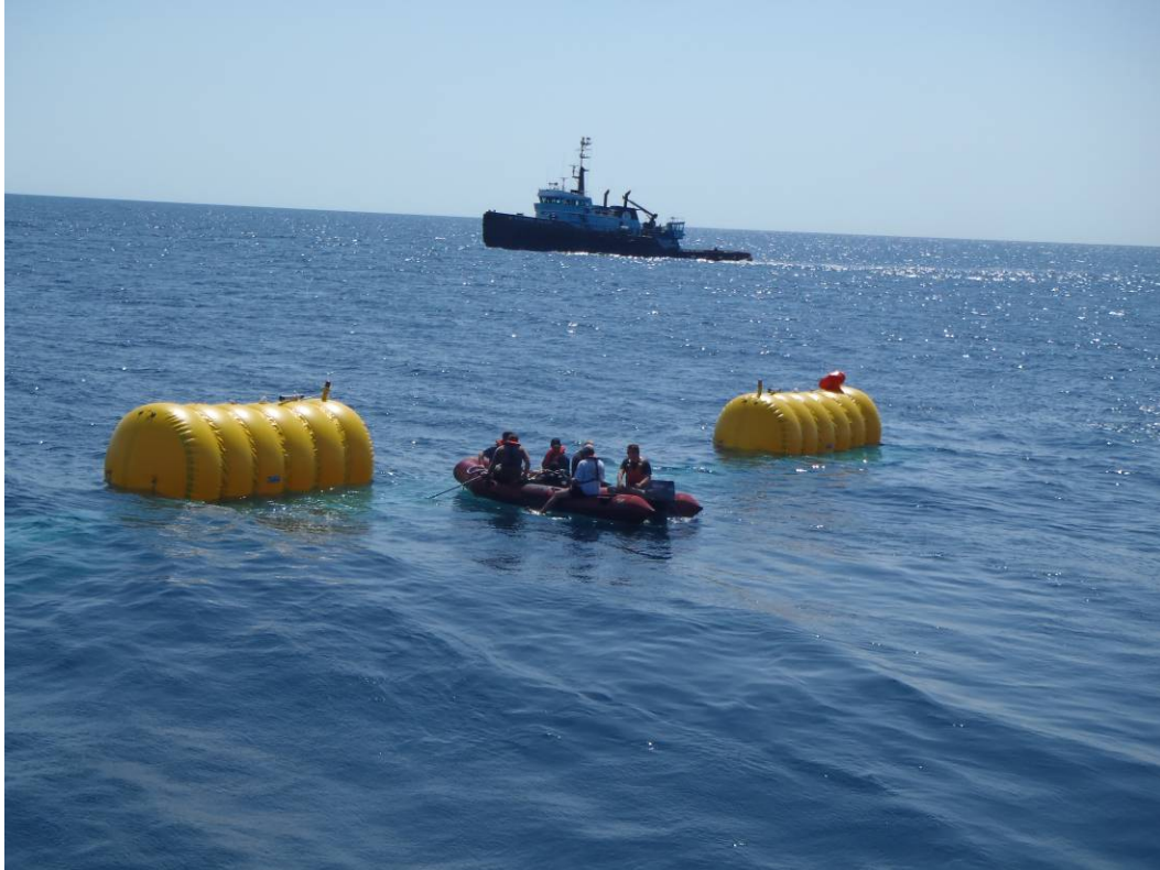
Divers are deployed tending the floating target. DONJON's tug Atlantic Salvor is in the background.

Weather again impacted operations. This time, it was Hurricane Katia's anticipated path up the western Atlantic. The timing couldn't have been better as the exercise was complete. All vessels headed to safe port. Operation successful.