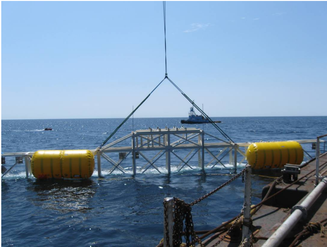
One of the targets being lowered into the water. The yellow air bags will keep the target floating near the surface. DONJON's tug Mary Alice is in the background.

support vessels remained busy with Columbia spending most of the exercise period in the safe zone while M/V Atlantic Salvor tended the Floating Target and M/V Mary Alice performed ferry services between the two and acted as a radio relay.