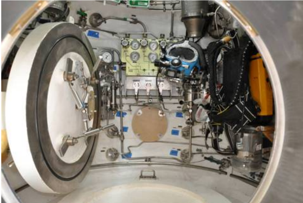
Inside the SAT FADS Diving Bell

SAT FADS completed the fabrication phase of the acquisition lifecycle in June 2010 and was subsequently relocated to Navy Experimental Dive Unit (NEDU) in Panama City, Florida where it has been reassembled for Manned Testing and certification. SAT FADS successfully completed its first manned dive on September 30th 2010. System commissioning will continue through operational evaluation, manned dives pier side, and ultimately successful conclusion of a 1,000 foot dry saturation dive.