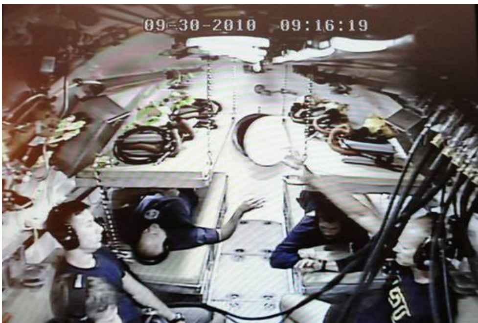
SAT FADS Living Quarters occupied by the test team during initial manned testing