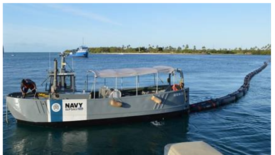
Class V Modular Vessel Skimmer getting underway from Alpha 7 pier in Pearl Harbor Naval Base. This skimmer system uses an absorbent belt to collect oil product herded by its booms.

In this exercise, SUPSALV deployed a Modular Vessel Skimmer System, four Boom Handling Boats (BHB's), and 300' of USS-26 Oil Containment Boom. The exercise was conducted by SUPSALV Emergency Ship Salvage Material (ESSM) contractor personnel stationed in Hawaii.