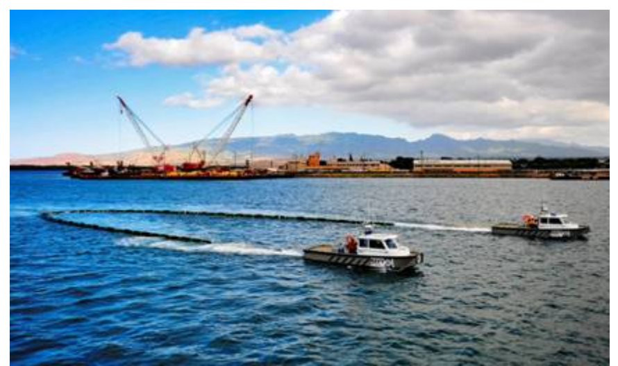
Two 30' Boom Handling Boats performing half-moon skimming maneuver.

SUPSALV conducted an OPA-90 Spill Response Training Exercise in Pearl Harbor, Hawaii this spring that gave them an opportunity to conduct realistic exercises with their spill response equipment and practice joint operations with the COMNAVREG Hawaii Navy On Scene Coordinator's (NOSC) spill response network, Mobile Diving and Salvage Unit ONE, Company 1-3, and various Pacific Fleet salvage, diving and pollution response representatives. The exercise, conducted April 7 – 11, also provided an opportunity for pier side and in-water training in the use of Off-Ship Firefighting System and Light Weight Hot Tap system.