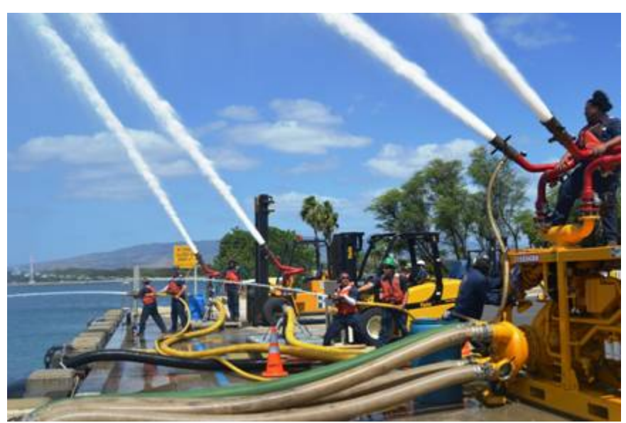
MDSU 1, CO 1-3 training on the use of the Portable Firefighting System.

SUPSALV maintains an extensive inventory of pollution response equipment at the Emergency Ship Salvage Material (ESSM) bases in Williamsburg, VA; Port Hueneme, CA; Anchorage, AK; Pearl Harbor, HI. Additional information on SUPSALV's pollution response capabilities can be found at <u>http://www.supsalv.org/00c25_home.asp</u>.