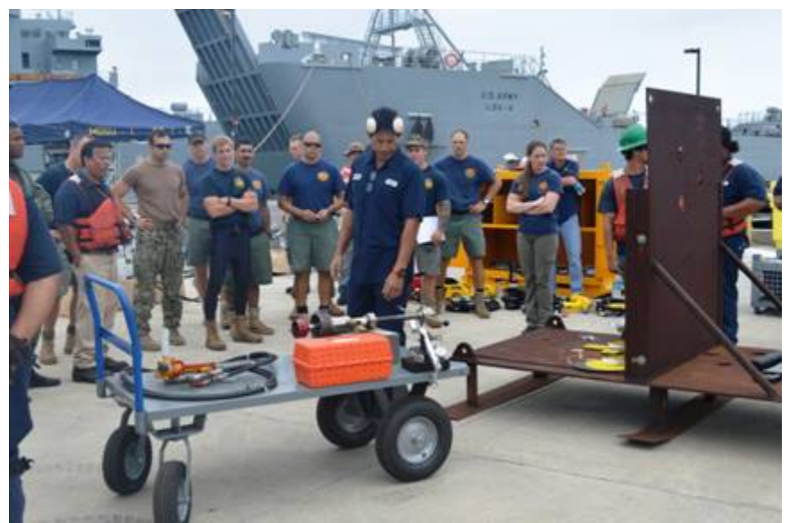
GPC, SUPSALV's ESSM contractor, provided hot tap training for on-surface and in-water phases using the 4" Lightweight Hot Tap. The Hot Tap system provides a means for divers to penetrate a steel hull or tank and to extract the oil trapped in the hull to prevent spillage.