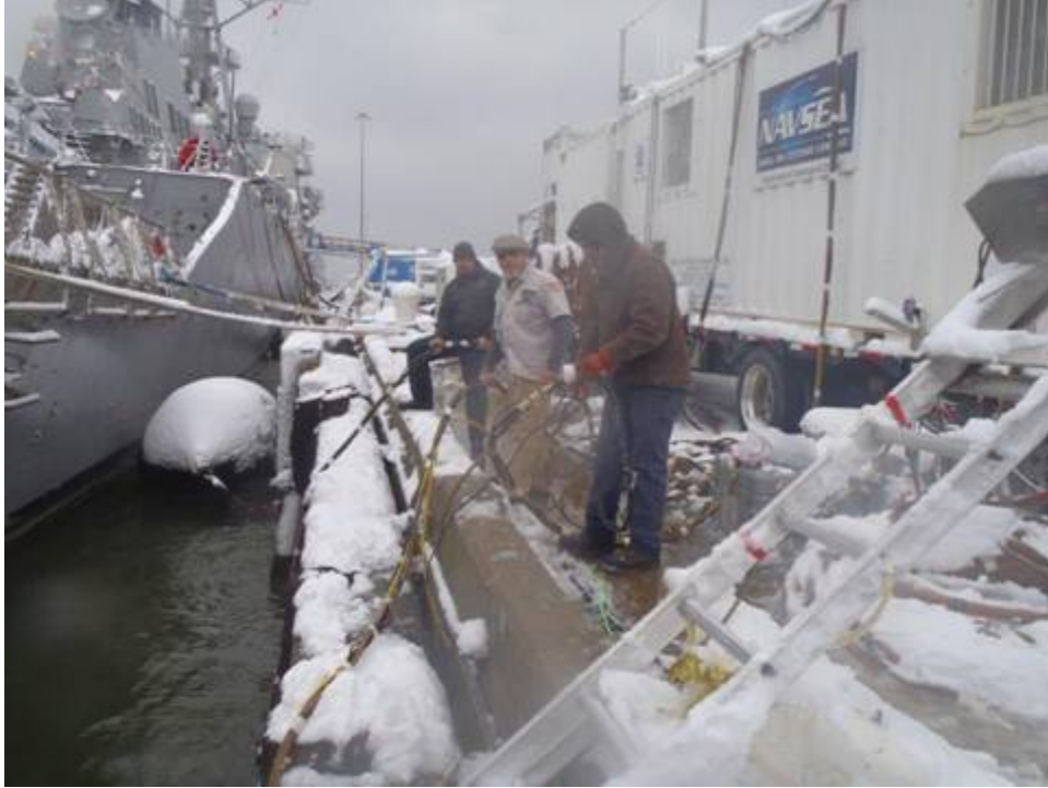
February 26 conditions at the dive site. Base closed for non-essentials, welders in the water, and snow on the pier.