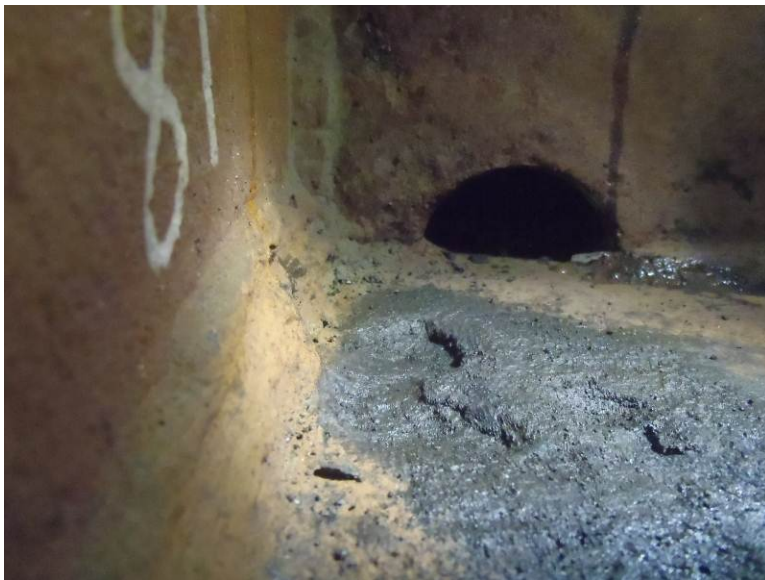
Example of corrosion found in a tank which needed to be cut out and patched.

To repair a deficiency, the team would place an external patch over of the section which needed repair. Then they would cut out the damaged steel and weld a plate in place from the inside. Then an open cofferdam would be installed on the outside of the ship which allows diver access and the plate would be prepped, welded and painted from within the cofferdam.