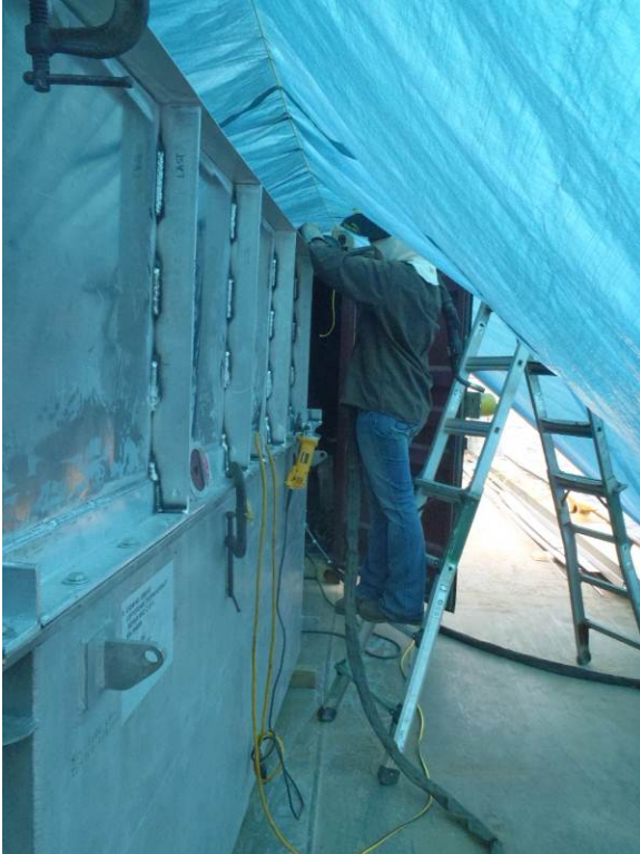
A team of divers, working under a cover on the dive barge, are welding the top hat of the open cofferdam. This configuration ensured the seal was effective and would allow in-water welding on the outside of the hull.