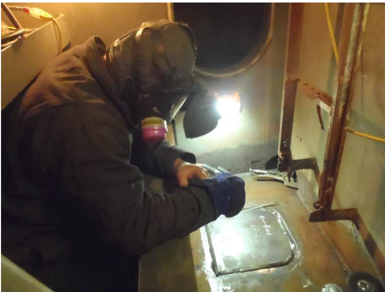
This picture shows a welder working inside the ship, beginning the weld repair with a root weld.

As the job progressed, the close inspection of the tank and adjacent fuel tank revealed more deficiencies than were originally expected and after a couple of weeks on the job, additional funds and an extension to the end date were requested to perform the newly discovered repairs. The new requirements resulted in the addition of the second shift of welder-divers to help complete the job as