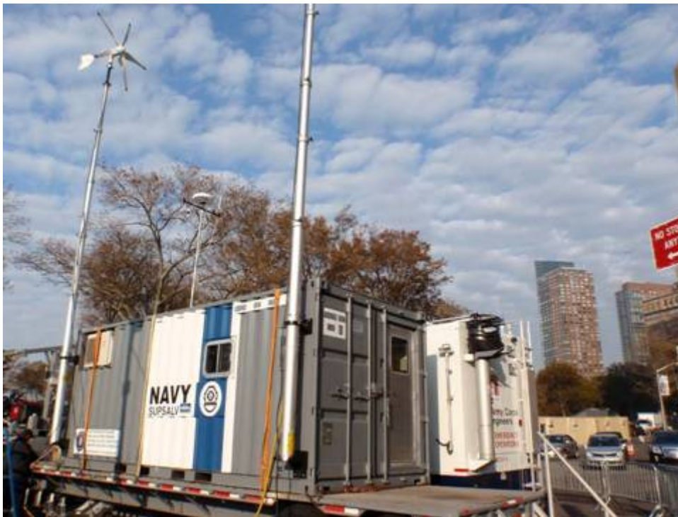
Throughout the operation SUPSALV manned the command center at Battery Park adjacent to the USACE command trailer.