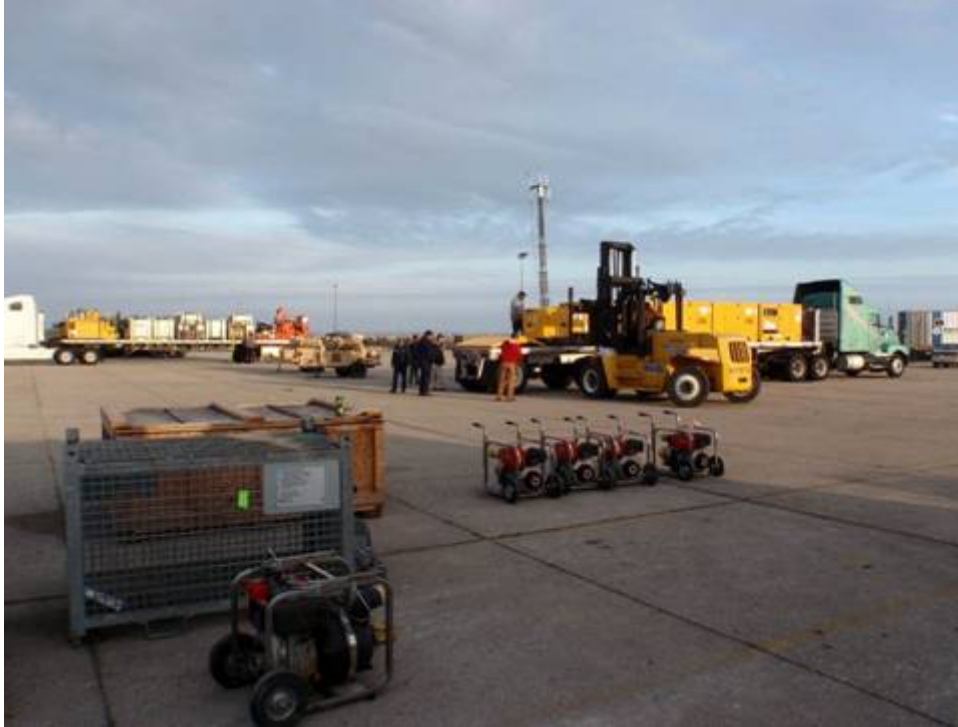
SUPSALV's ESSM pumps and generators being unloaded and staged at Fort Dix, NJ for use in dewatering missions.