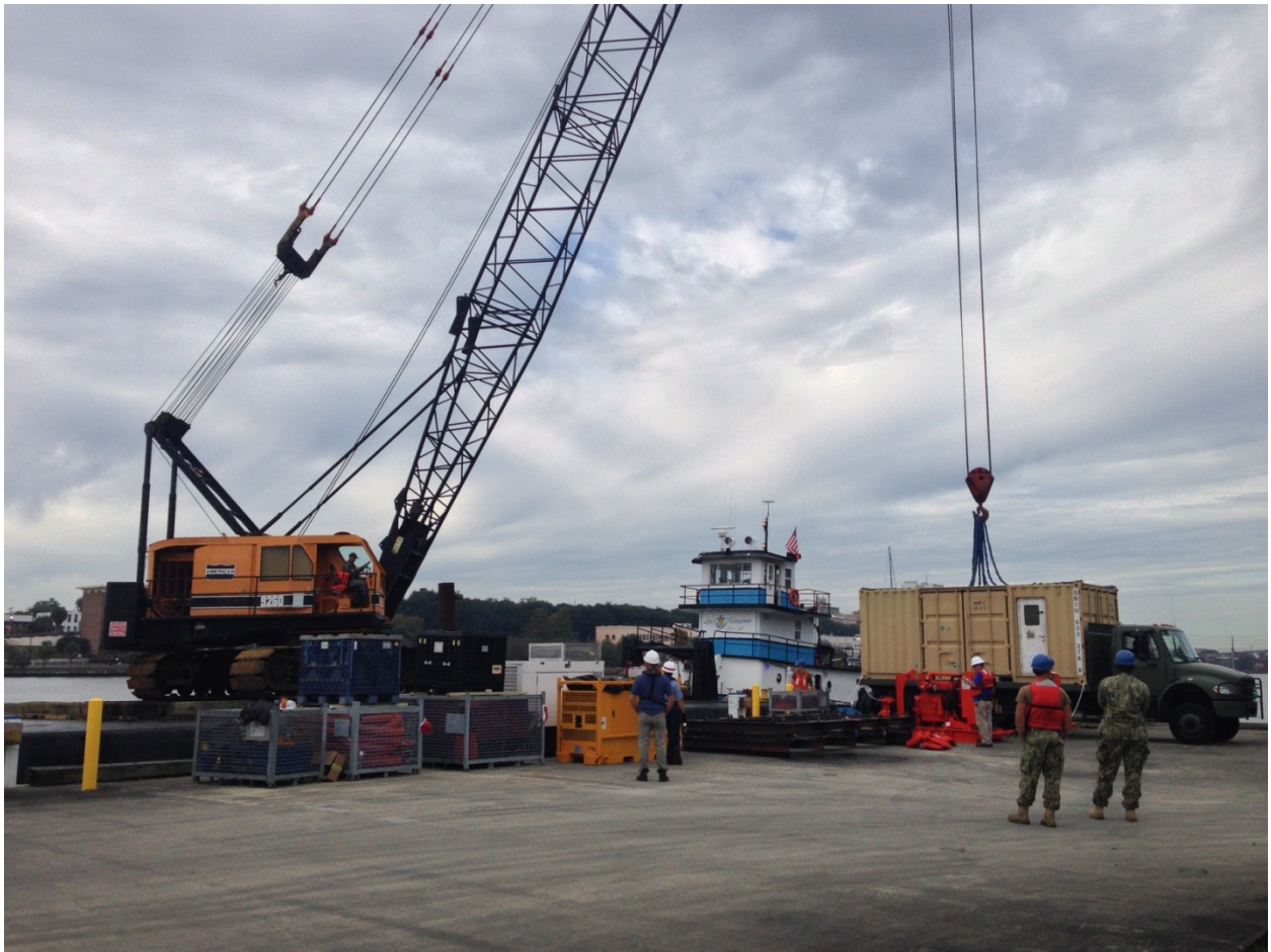
7 November 2013 image of the salvage crane barge and ESSM and MDSU TWO equipment staged pier side.