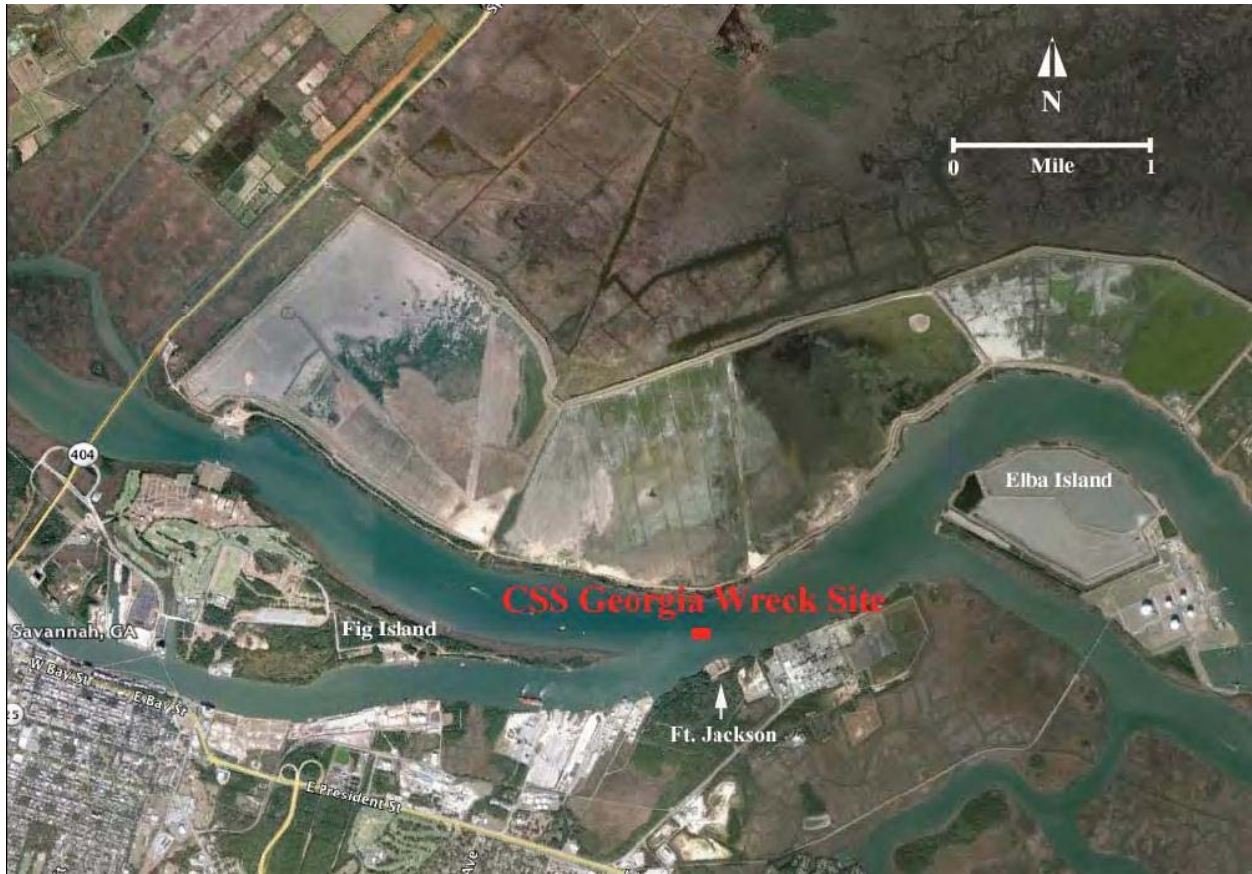
Location of the CSS GEORGIA wreck site.

The U.S. Army Corps of Engineers is undertaking the Savannah Harbor Expansion Project ( http://sav-harbor.com/ ) which includes dredging the channel to a depth of 47 feet to support the passage of larger container ships. This planned dredging would have further adverse impacts on the artifact's remains necessitating a comprehensive salvage operation before dredging begins.