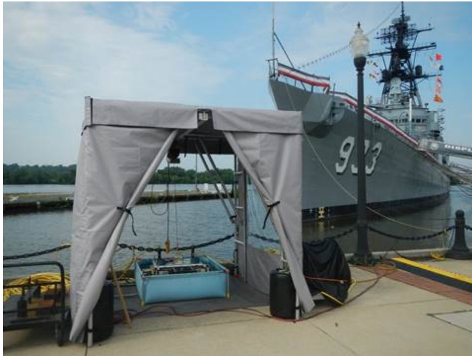
Display Ship BARRY docked at the Washington Navy Yard with hull survey equipment staged on the pier.

SUPSALV is completing a waterborne underwater hull cleaning and hull survey of DISPLAY SHIP BARRY (EX DD 933) located on the banks of the Anacostia River at the Washington Navy Yard this week. The underwater survey follows a Salvage Assessment of the BARRY that was conducted in December 2013 – January 2014. The Salvage Assessment was undertaken to obtain an engineering analysis on the current condition of BARRY and identify possible options for movement or stabilization of the display ship in advance of the South Capitol Street Bridge rebuilding project (estimated start - April 2015) which will result in a fixed span bridge under which the BARRY cannot pass beneath without significant modifications to the superstructure.