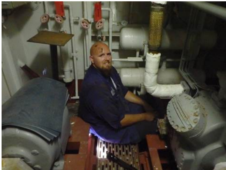
SUPSALV's Emergency Ship Salvage Material Contractor, GPC, provide the response team who monitored the ship's ballast tank levels, voids and bilges during the hull cleaning process. In this photo, the ESSM mechanic is exiting a void after verifying its condition.

To maximize safety during the cleaning operations, SUPSALV provided a 5-man emergency response team to monitor ballast tank levels and inspect voids and bilges 24/7 during the cleaning process in case of water ingress. This team also pre-staged de-watering equipment throughout the ship to activate on a moment's notice. In this case, no leaks were encountered and the response team removed their pre-staged hoses, emergency hydraulic pumping systems, and magnetic patches at the completion of the hull cleaning process.