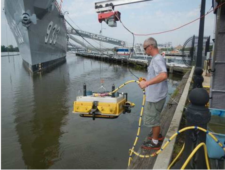
LAMPRAY being launched into the Anacostia River just off the bow of Display Ship BARRY.