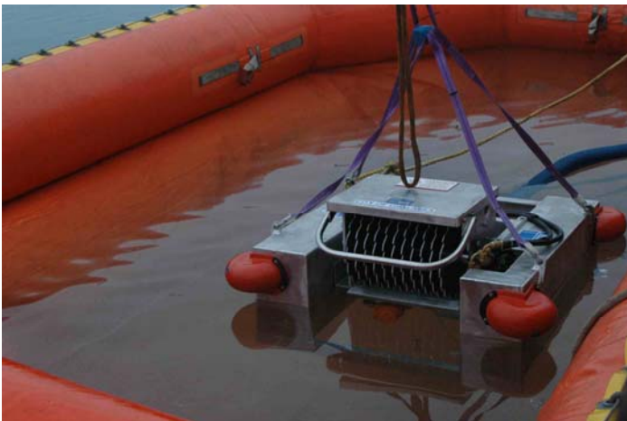
Figure 4 – Typical Small Disc Skimmer being placed in the Containment (Separator) Pocket

from the skimmer head to tanks on the support vessel or to a SUPSALV oil storage bladder towed astern of the support vessel. The single-vessel configuration with a large support vessel offers obvious advantages for sustained offshore operations. Under some conditions the 45' system sweep width offered by the SUPSALV outrigger system can be increased with an additional tow boat and extended sweep boom outboard of the outrigger. And a second High Speed VOSS system could be supported off the starboard side of the large support vessel indicated in figure 2.