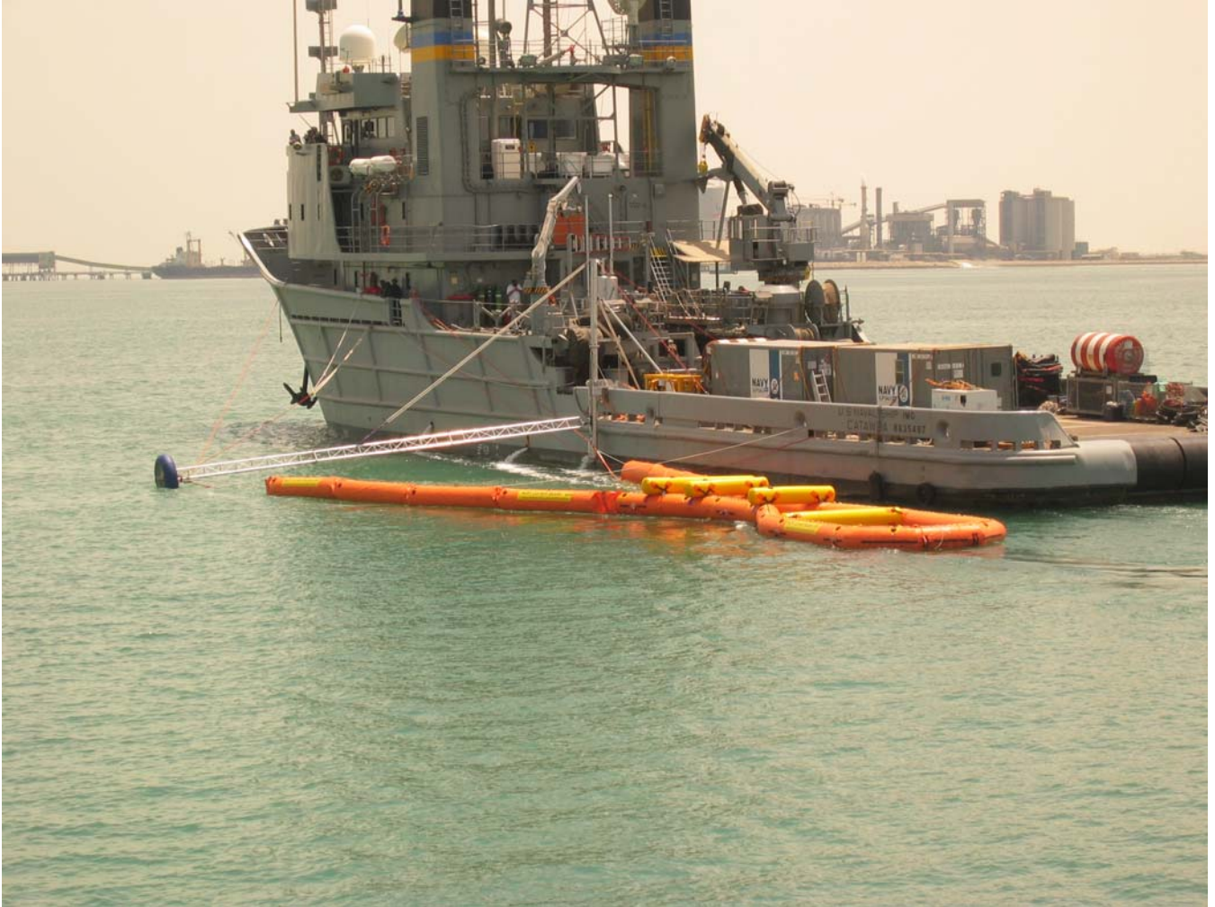
Figure 5 – SUPSALV High Speed VOSS in single-vessel configuration on USNS Catawba (T-ATF 168)