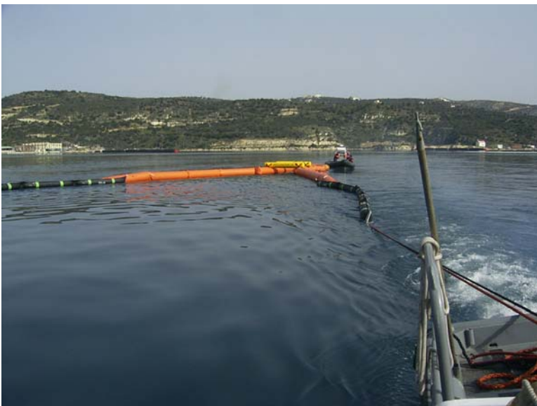
Figure 2 – SUPSALV High Speed VOSS in 3-vessel configuration

larger sea surface area in a given time period, provides for improved support vessel maneuverability, and permits the use of skimmer support vessels that cannot operate at the lower skimming tow speeds.