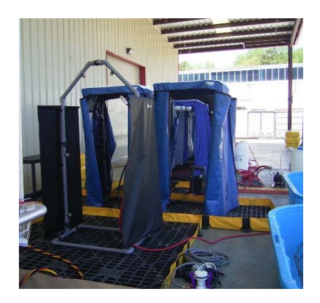
FIGURE C-4 Wash Shower with Yellow Berm and DECON Deck Grating

FIGURE C-3 Yellow Containment Barrel and Diver's Umbilical with Berm and DECON Deck Grating