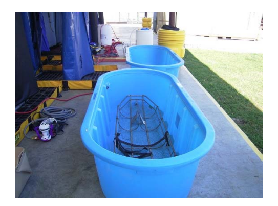
FIGURE C-14 Emergency Wash Tub with Stokes Stretcher and Emergency Rinse Tub