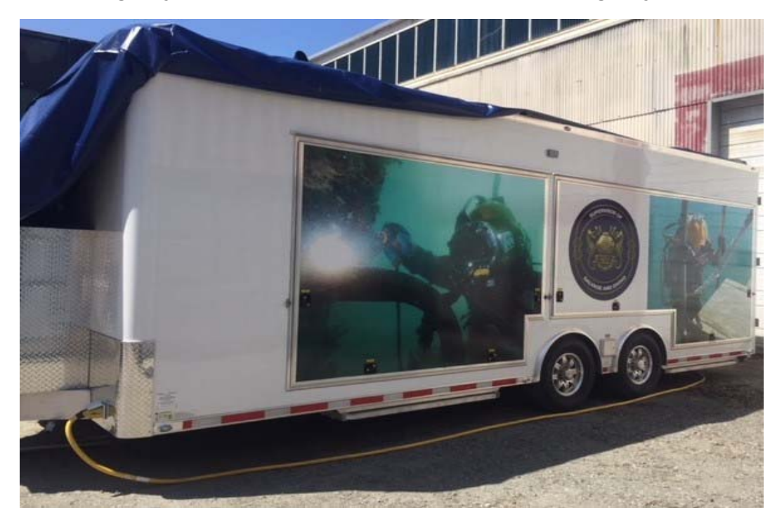
FIGURE C-15 NAVSEA Dive System Trailer