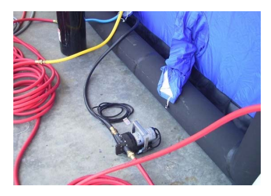
FIGURE C-12 Zumro DECON Tent Dewatering 110V Electric Pump and Hoses

FIGURE C-11 Zumro DECON Tent Inflator Connection