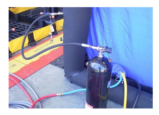
FIGURE C-11 Zumro DECON Tent Inflator Connection

FIGURE C-10 Cold Zone, Final Dry/Dressing Berm (privacy panels not shown)