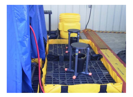
FIGURE C-6 Diver Undress Area. Table for Helmet DECON and Yellow Container for Dive Suit and Clothing. Berm, Seats, and DECON Deck Grating (privacy curtain not shown)