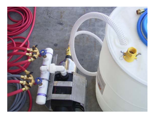
FIGURE C-8 110V Electric Water Supply Pump with manifold, shut-off valves, with suction hose and red supply hoses to showers. White 50 gal clean water supply container

FIGURE C-7 12V Electric Submersible Pump for dewatering berms, 50' Grey Discharge Hose, 50' Electrical Power cord with On/Off Switch