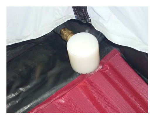
FIGURE C-13 Zumro DECON Tent Dewatering Strainer (inside)