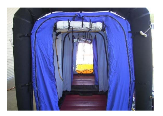
FIGURE C-9 Zumro DECON Tent Skin Wash and Rinse (two separate showers)