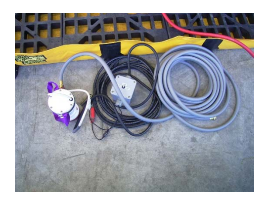
FIGURE C-7 12V Electric Submersible Pump for dewatering berms, 50' Grey Discharge Hose, 50' Electrical Power cord with On/Off Switch

FIGURE C-6 Diver Undress Area. Table for Helmet DECON and Yellow Container for Dive Suit and Clothing. Berm, Seats, and DECON Deck Grating (privacy curtain not shown)