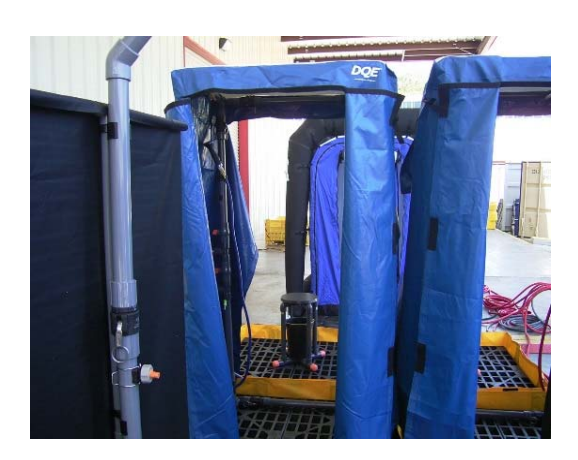
FIGURE C-5 Rinse Showers with Yellow Berm and DECON Deck Grating

FIGURE C-4 Wash Shower with Yellow Berm and DECON Deck Grating