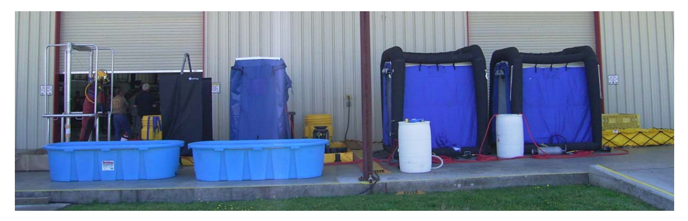
FIGURE C-1 DECON Station Assembled