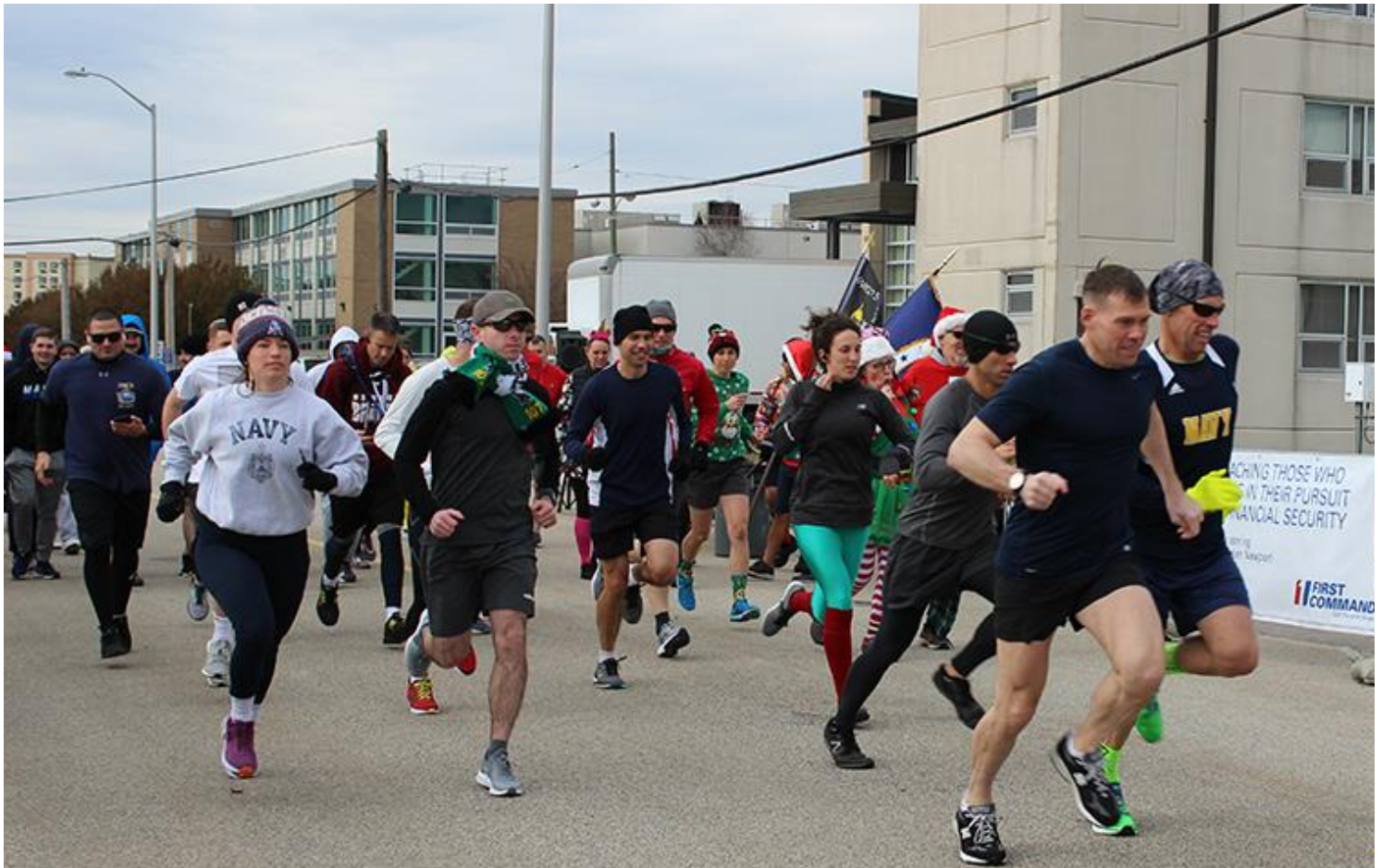
Runners push towards the finish line at the MWR-hosted Turkey Burn-Off Nov. 9 at Naval Station Newport.