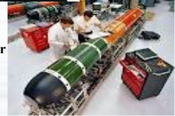
E13 Ordnance Assessment & Logistics

Distribution A (#21-201). Approved for public release. Distribution unlimited.