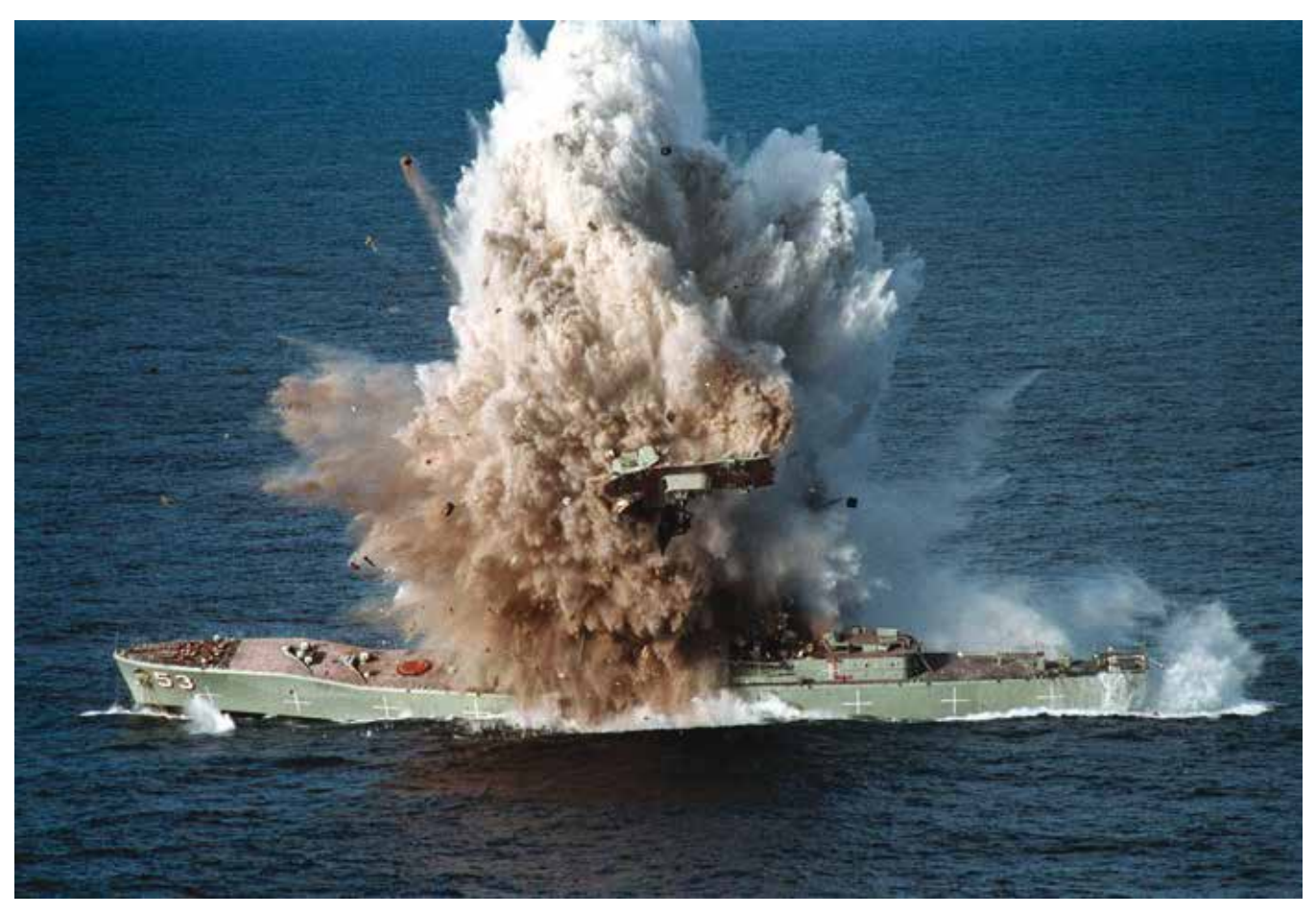
Computer simulations reduce the need to conduct real-world tests of explosives, saving money and lessening the environmental impact.

capable of defeating these targets was requested. Indian Head researchers assisted in development of the "novel explosive," or NE, warhead for the Shoulder-launched Multipurpose Assault Weapon (SMAW). The NE warhead produces pressures capable of leveling the intended target. DYSMAS was used to analyze the mechanical behavior of the warhead during penetration, leading to important fuze design modifications.