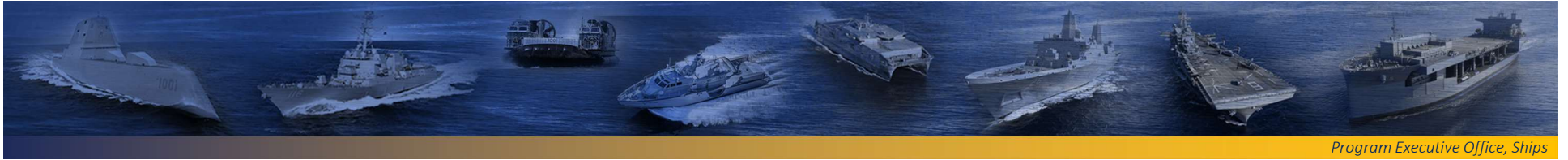
Program Executive Office, Ships