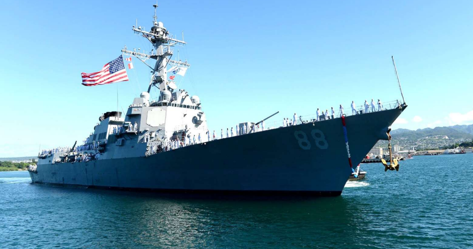
USS PREBLE (DDG 88) In Progress