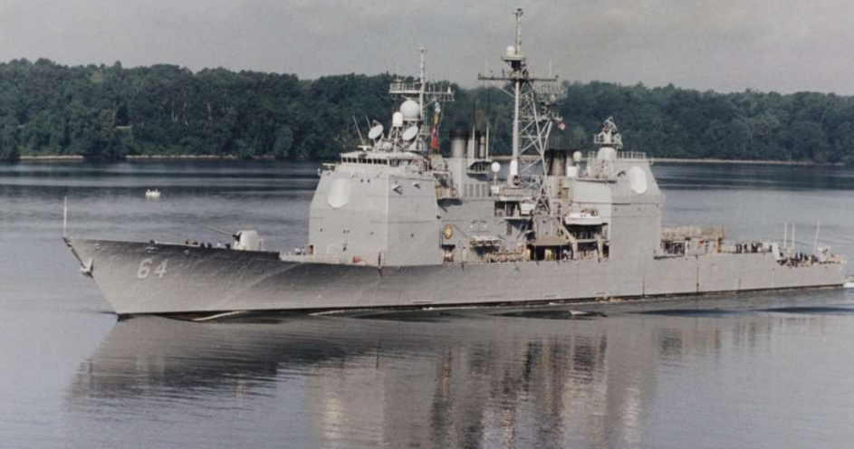
USS GETTYSBURG (CG 64) In Progress