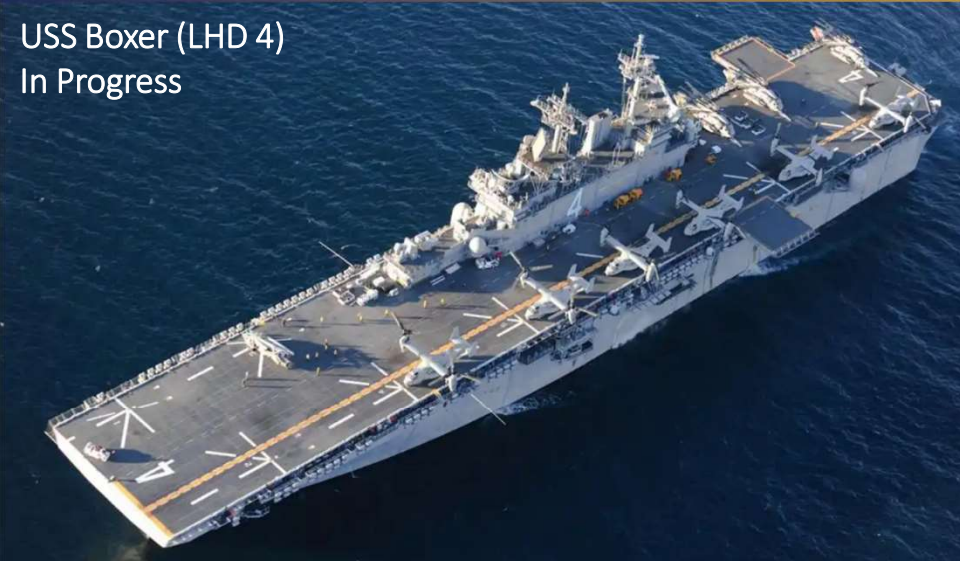
USS Boxer (LHD 4) In Progress