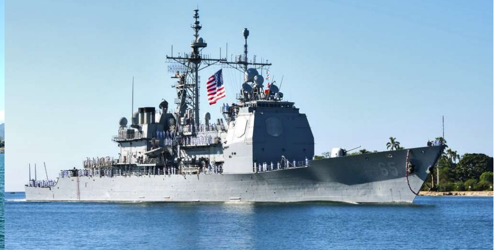
USS CHOSIN (CG 65) In Progress