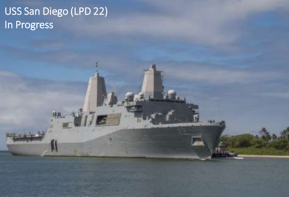
USS San Diego (LPD 22) In Progress