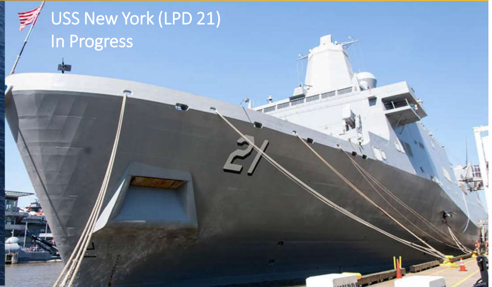
USS New York (LPD 21) In Progress