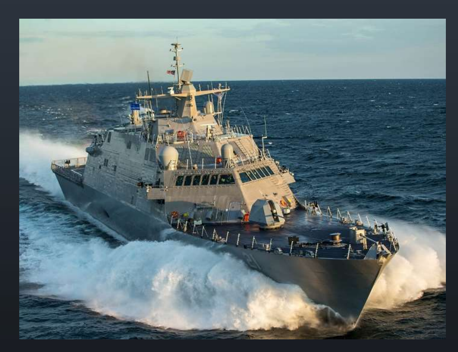
USS Minneapolis-Saint Paul (LCS 21)