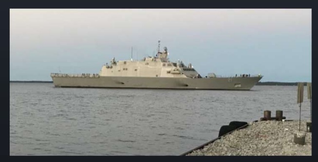
LCS 21 Combining Gear Trial