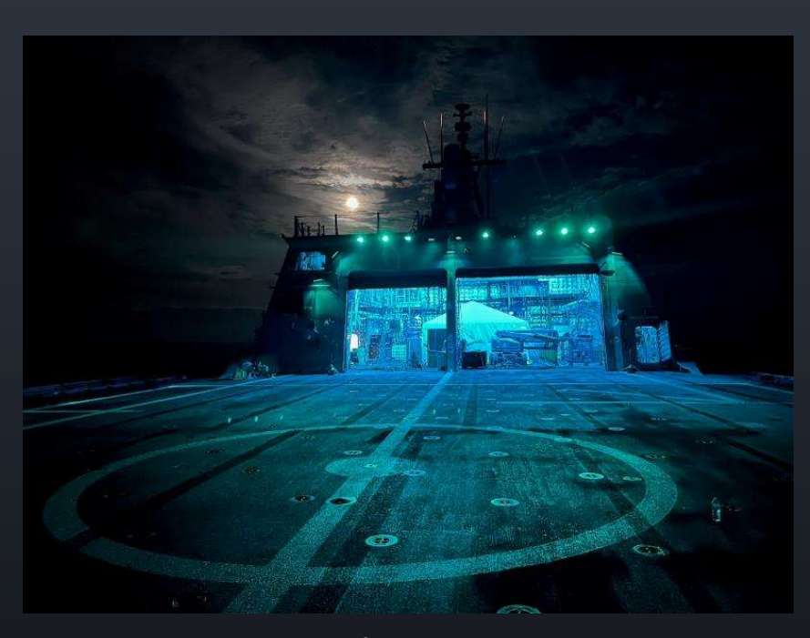
USS Canberra (LCS 30)