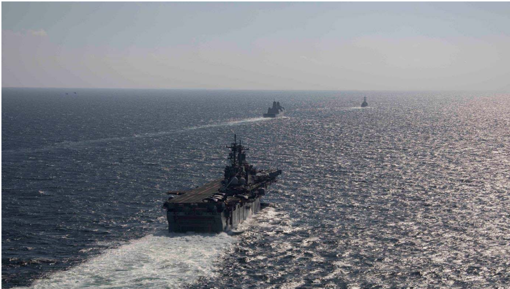
USS KEARSARGE (LHD 3), USS ARLINGTON (LPD 24) and USS MCFAUL (DDG 74) ATLANTIC OCEAN – 20 OCT 2018