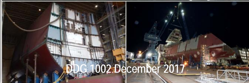
DDG 1002 December 2017