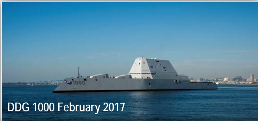
DDG 1000 February 2017