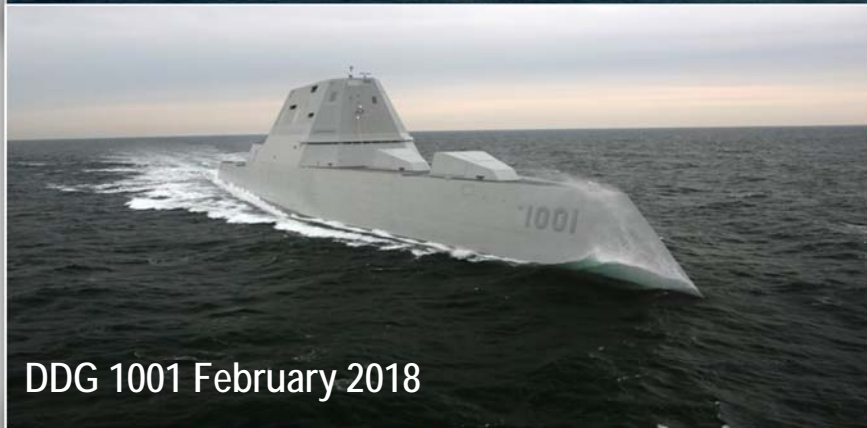
DDG 1001 February 2018