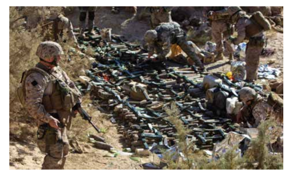
Marine Corps EOD stages unexploded ordnance in Cigini, Afghanistan.